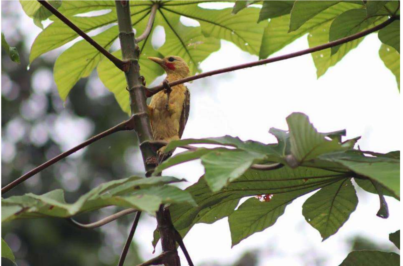
Male Cream-colored Woodpecker