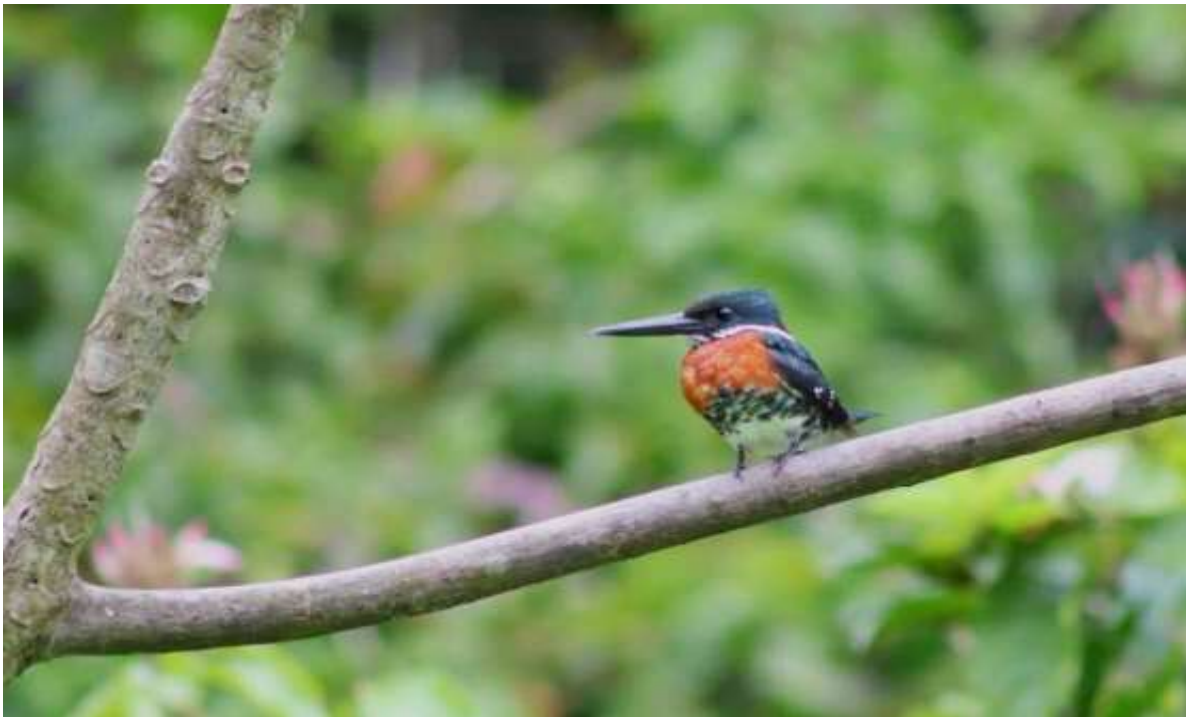
Green Kingfisher