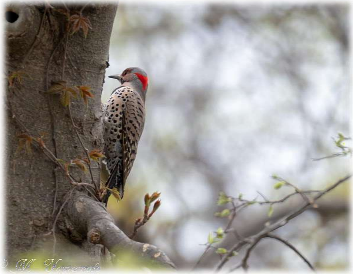
Pileated Woodpecker - Dryocopus pileatus