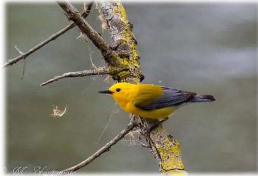
Tennessee Warbler - Oreothlypis peregrina

About three seen at Magee Marsh Wildlife Area. Threatened by Climate Change