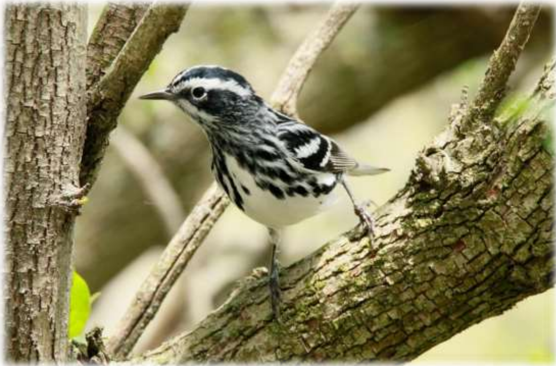
Black-and-white Warbler

The tours were managed by costume and design to cover the habitats and record its key species