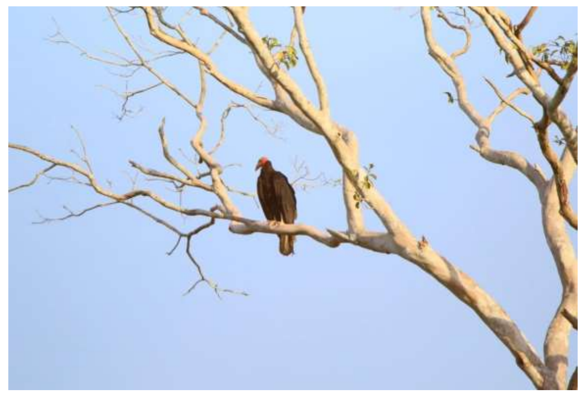
Greater Yellow-headed Vulture - Richard Amable