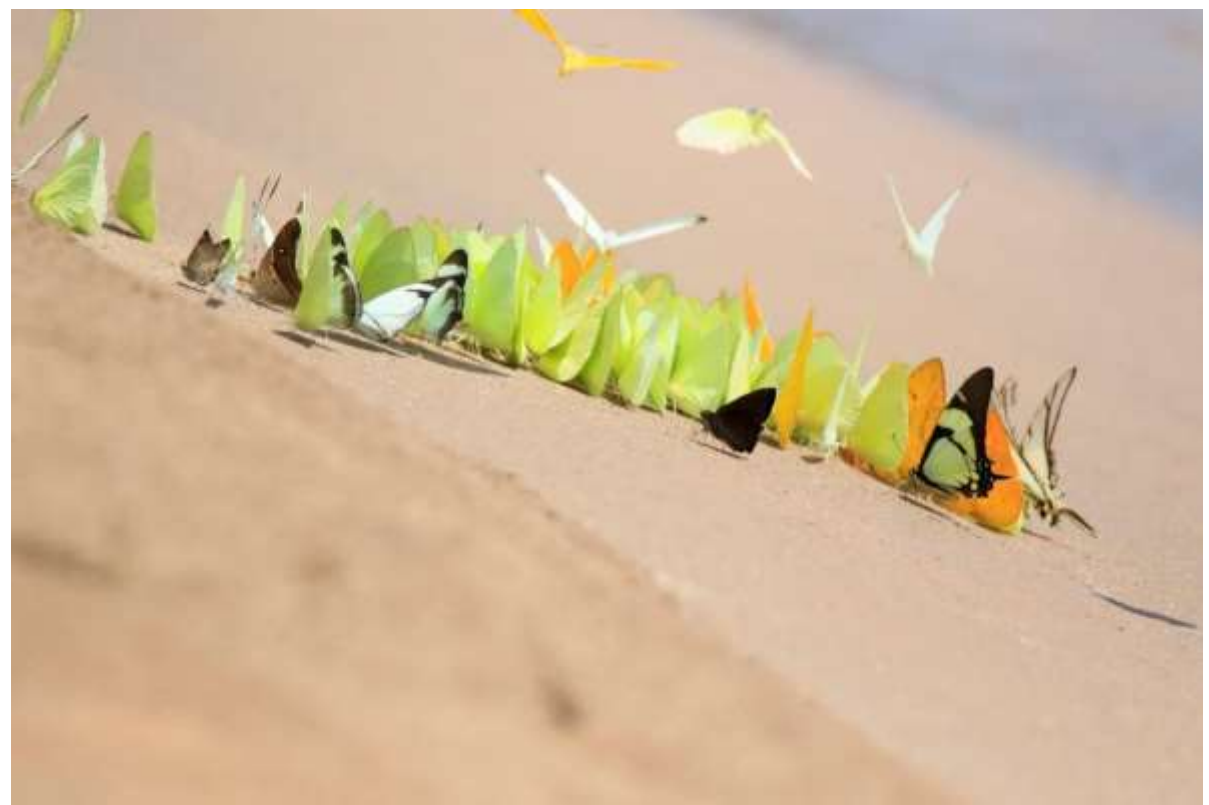
Sulphur's Butterflies at Rio Tambopata - Richard Amable