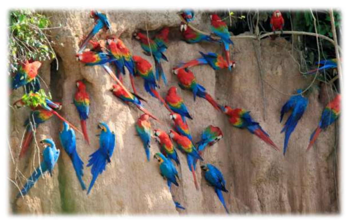
Collpa Chuncho – Richard Amable

The Tambopata National Reserve is 274,690 hectares and located in the Amazon basin of southeast Peru, spans areas of biodiverse rainforest. Rich in wildlife, it's home to many colorful parrots and macaws that feed at clay licks such as the Collpa Colorado and the Chuncho. Near, the Tres Chimbadas lake is surrounded by pristine forest and old trees, and wetlands, home to river otters and black caimans.