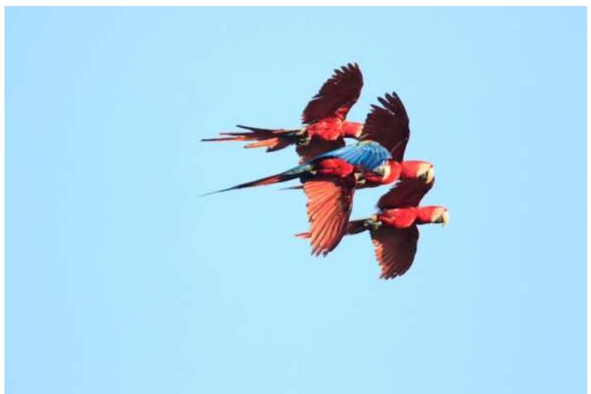
Red-and-green Macaw family