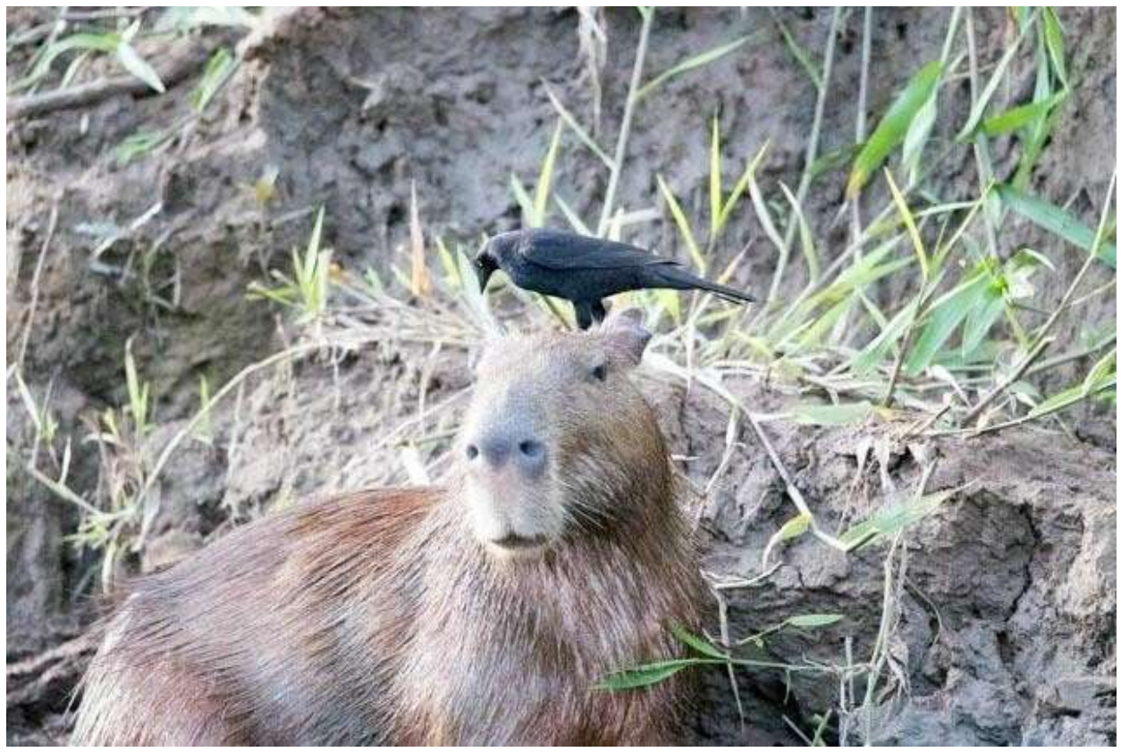
Capybara and Giant Cowbird