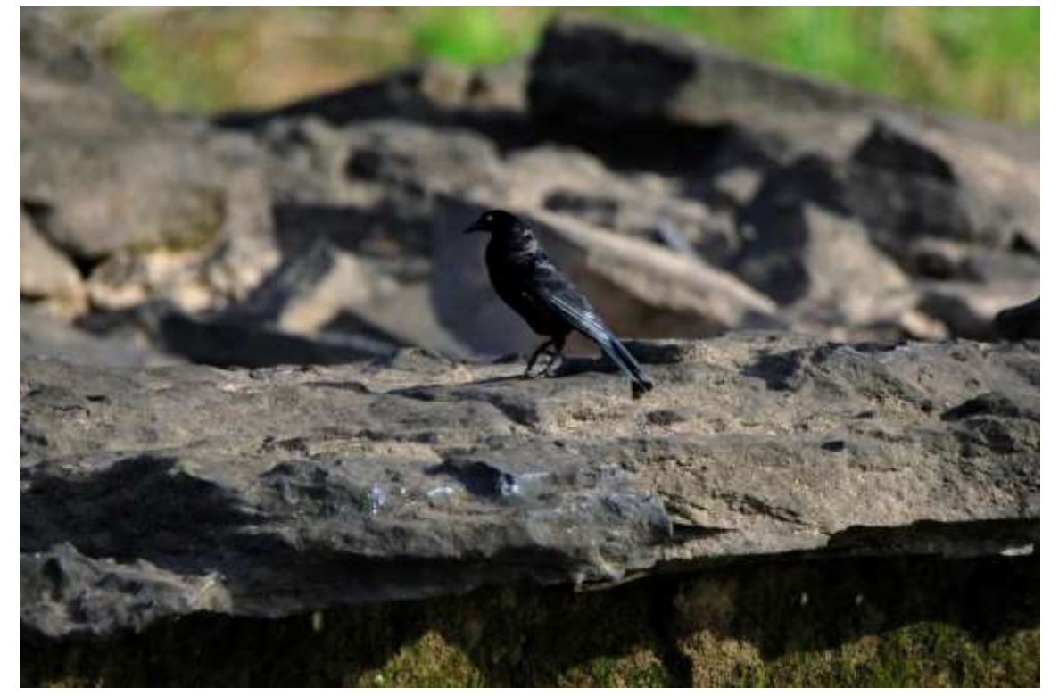
Giant Cowbird