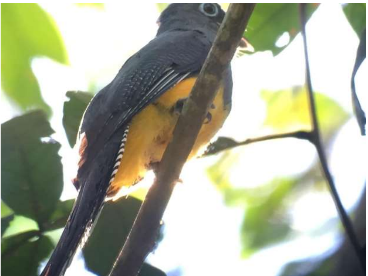
Green-backed Trogon – Richard Amable

Green-backed Trogon - Trogon viridis Only one seen at Collpas Tambopatas Inn