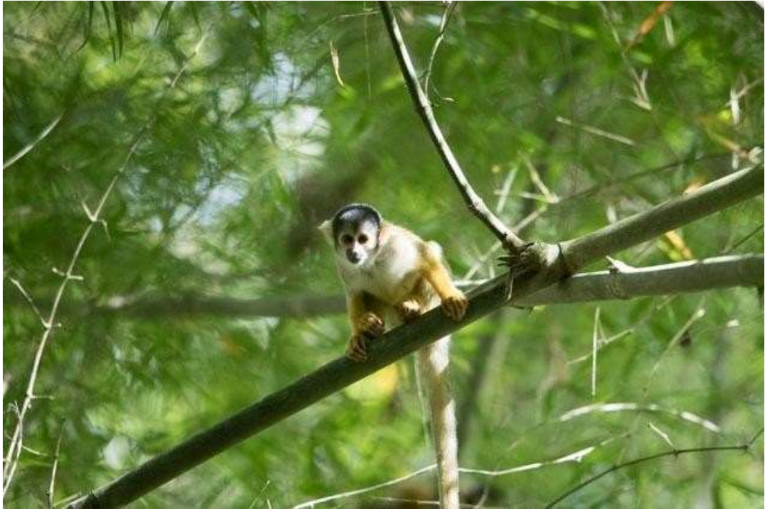
Bolivian Black-capped Squirrel Monkey