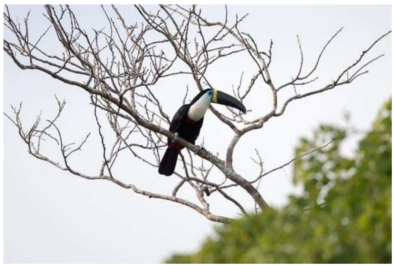
Channel-billed (Yellow-ridged) Toucan

WOODPECKERS (Picidae) Yellow-tufted Woodpecker - Melane rpes cruentatus Common at Explorer's Inn