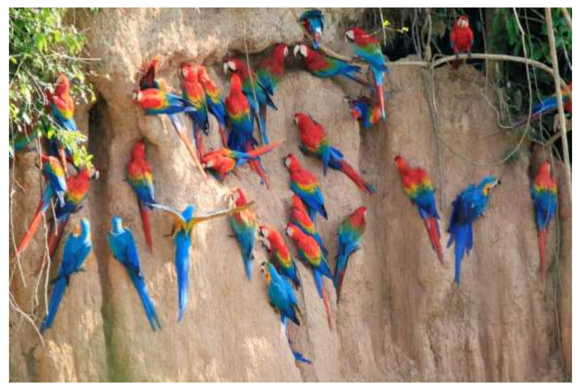
Chuncho Macaws Clay Lick