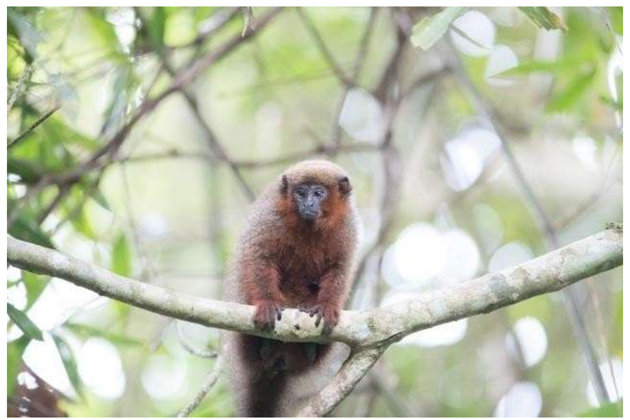
Toppin's Titi Monkey

Toppin's Titi Monkey – Callicebus toppini Few seen at collpas tambopatas Inn