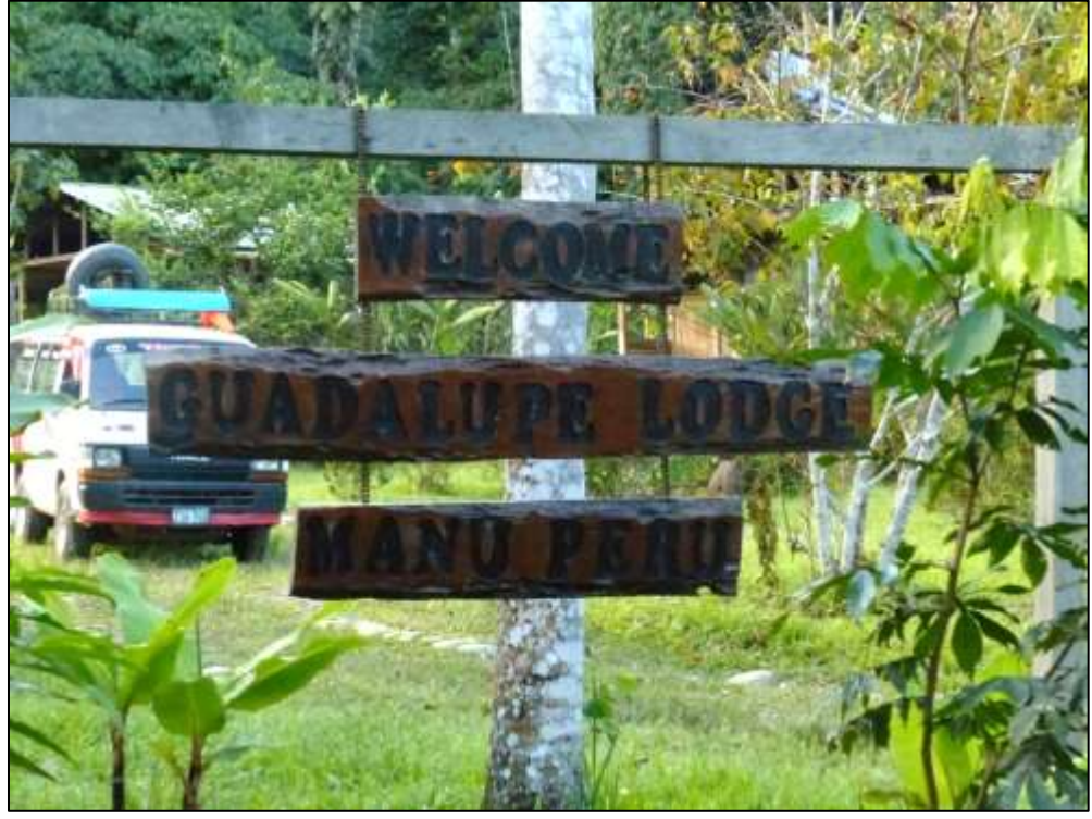
Welcome to Guadalupe Lodge