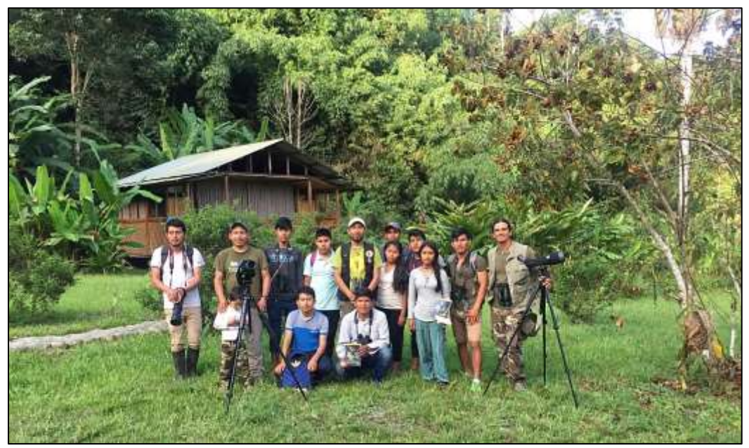
The crew of participant at Guadalupe Lodge