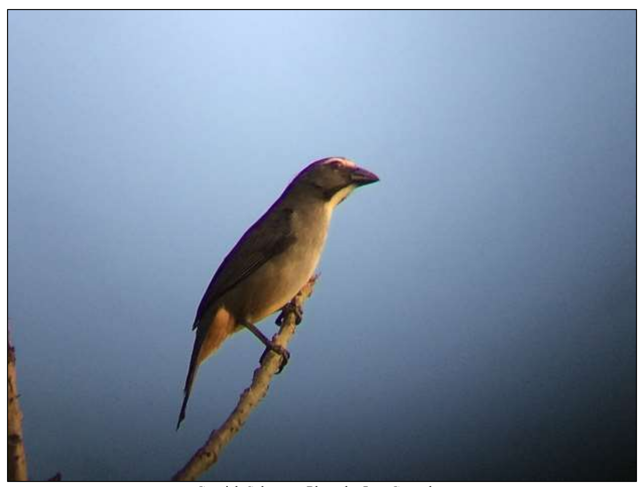
Grayish Saltator