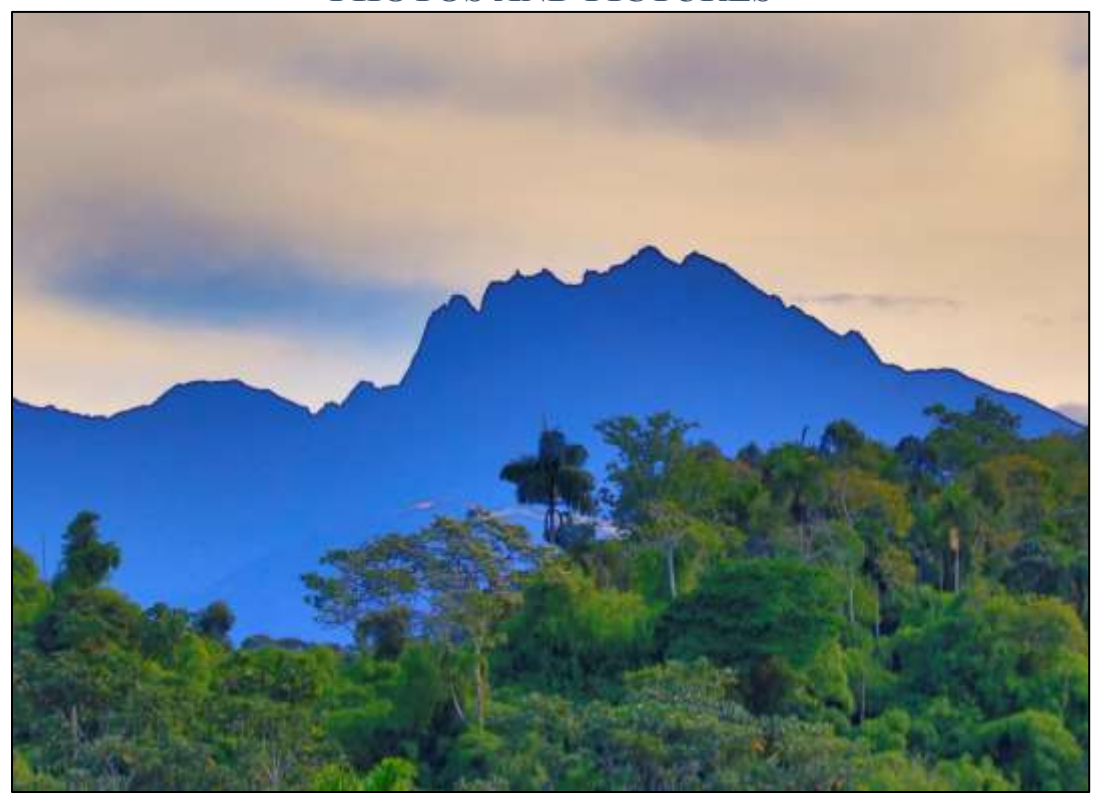
Wonderful view of the Andean mountains at Guadalupe Lodge