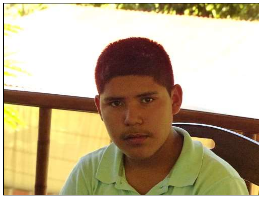
Young participant from Pilcopata town, training leader for the future