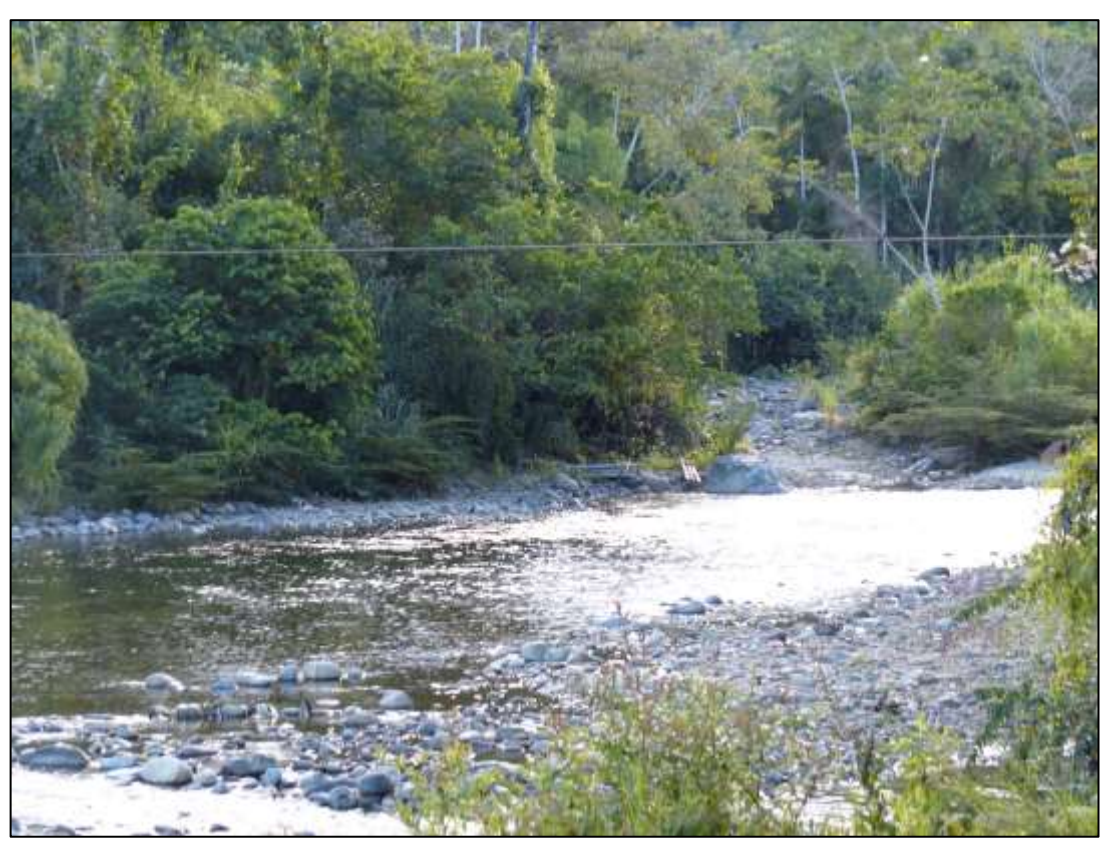
Crystalline water of the Guadalupe Creek