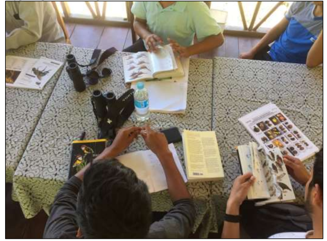
Gear and books to perform birding in action program