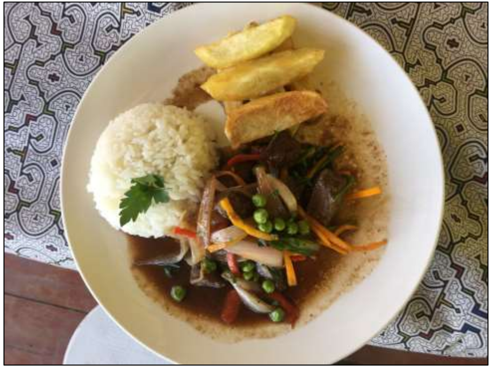
Delicious Lomo Saltado dish for lunch