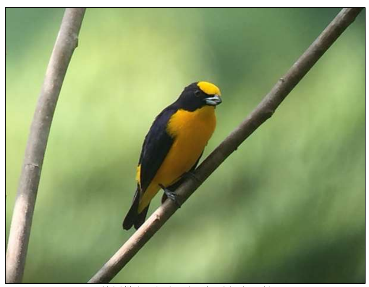
Thick-billed Euphonia