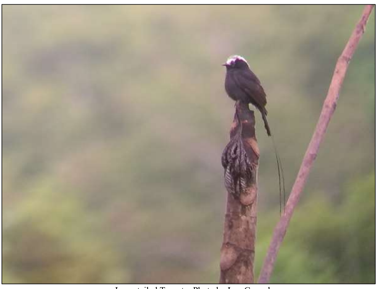
Long-tailed Tyrant

Long-tailed Tyrant - Colonia colonus * Two using same perched, seem near the lodge