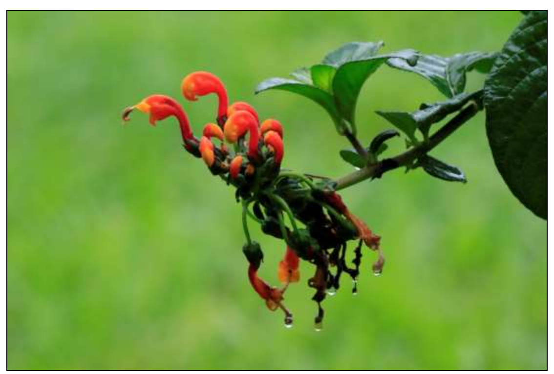
Key flower for the key species such as the Buff-tailed Sicklebill