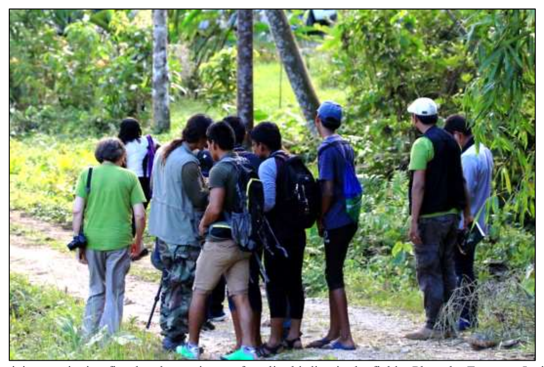
Participant enjoying first-hand experience of quality birding in the field