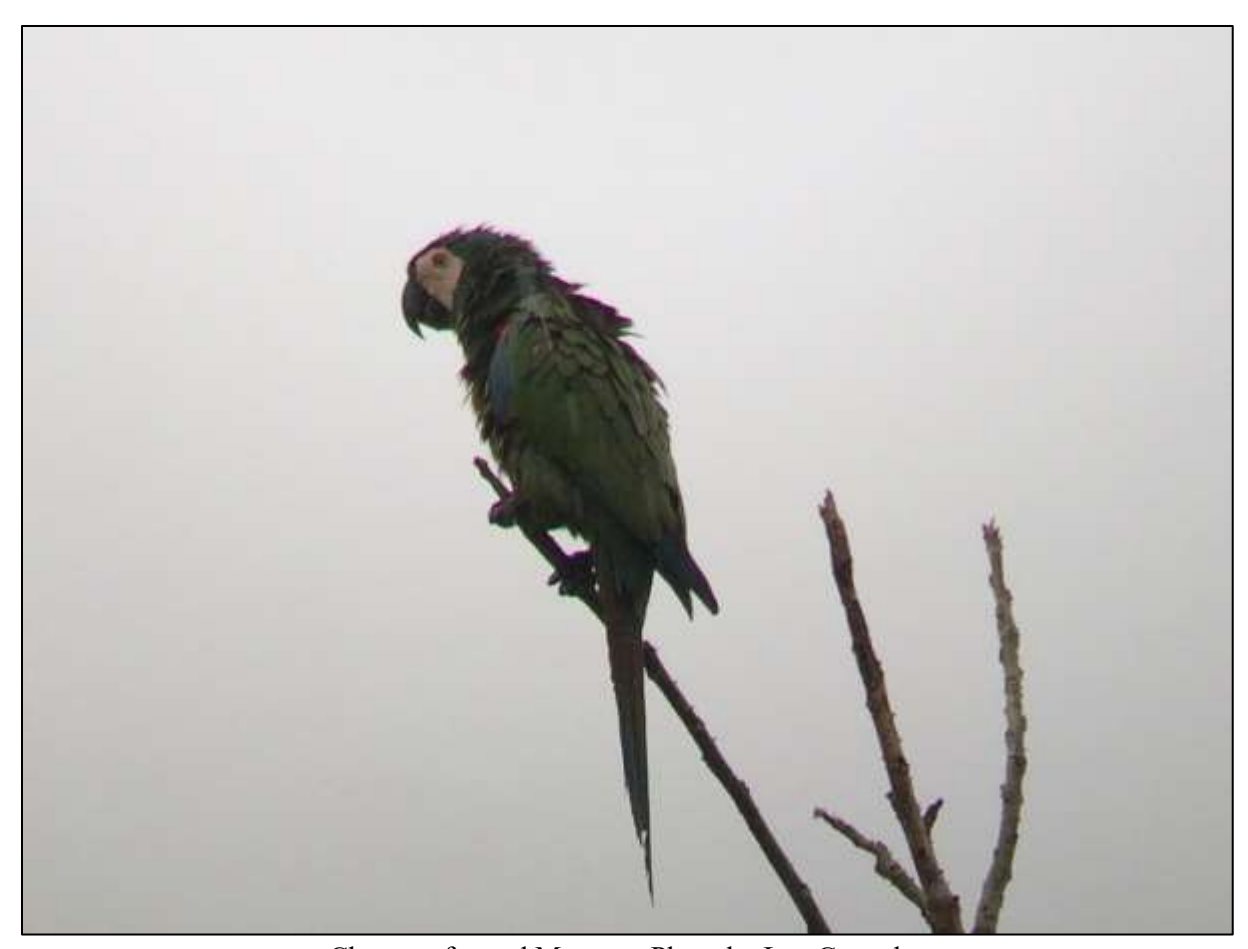
Chestnut-fronted Macaw