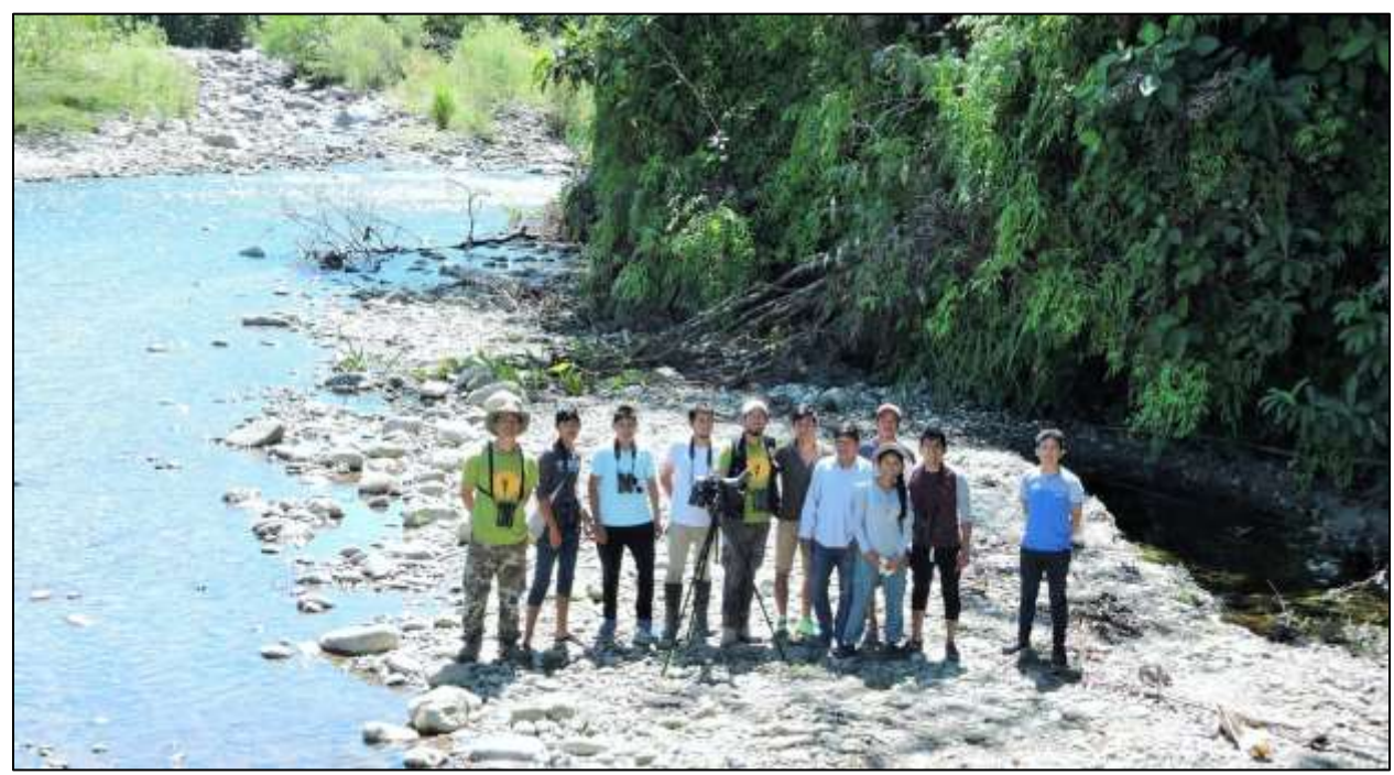
The crew of participant at Guadalupe Creek