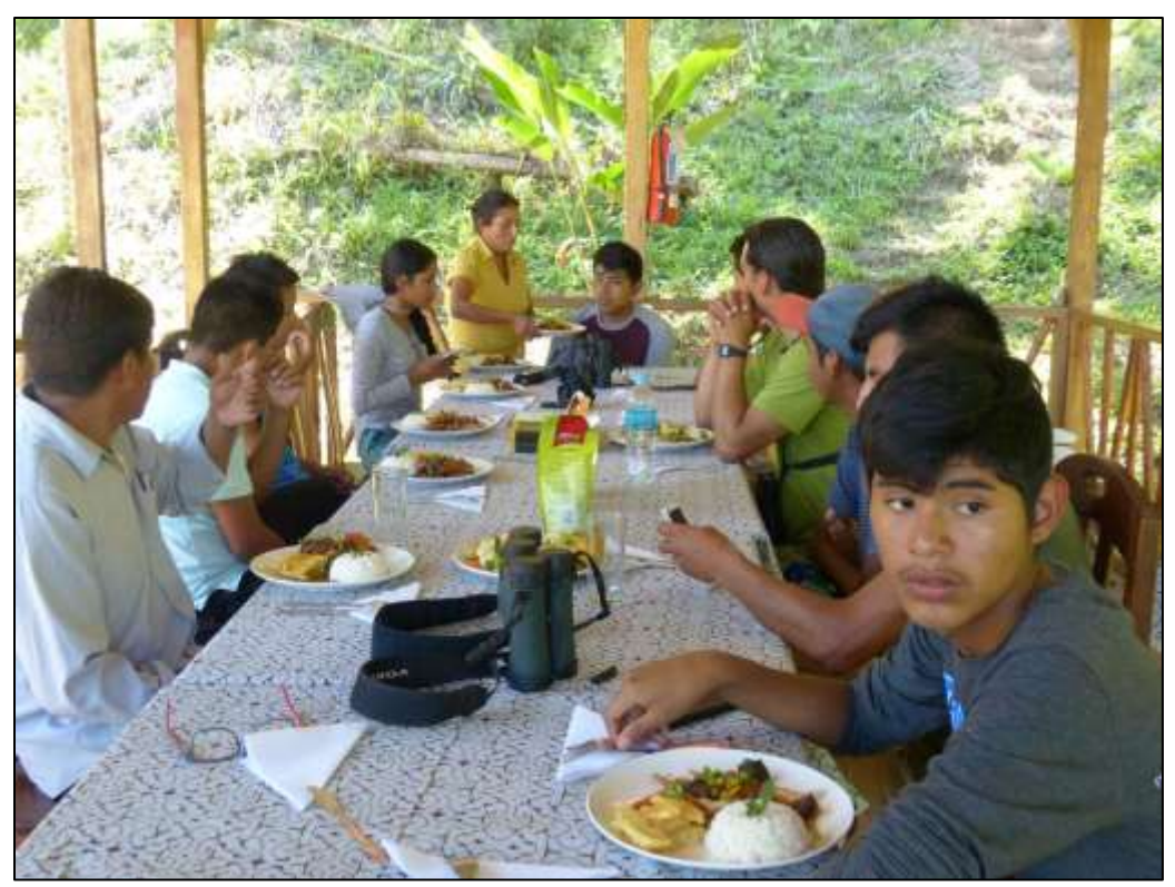
Lunch with all the participants at Guadalupe Lodge