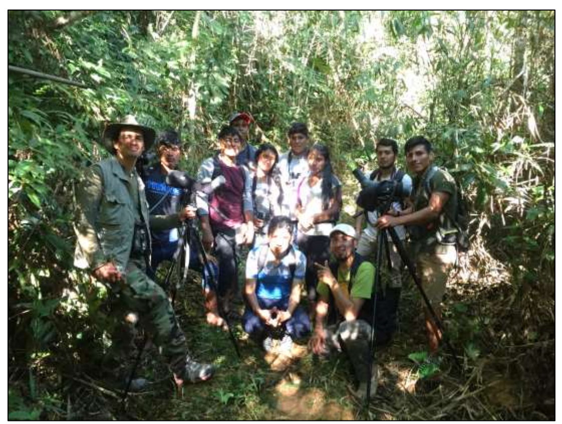
The crew of participant at the trail of bamboo forest