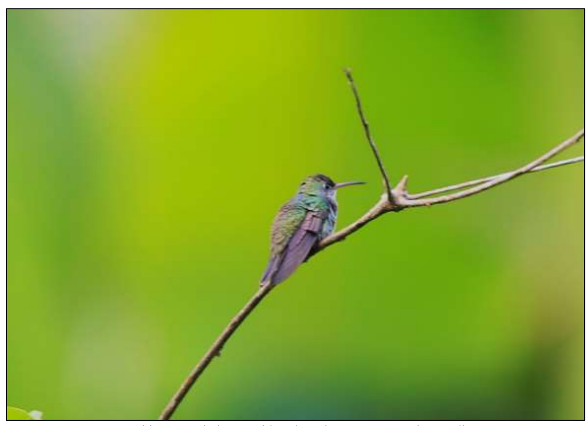
Sapphire-spangled Emerald