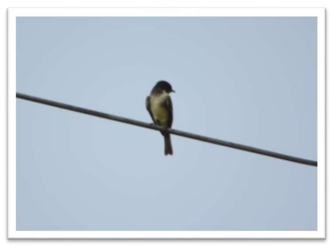
Eastern Phoebe