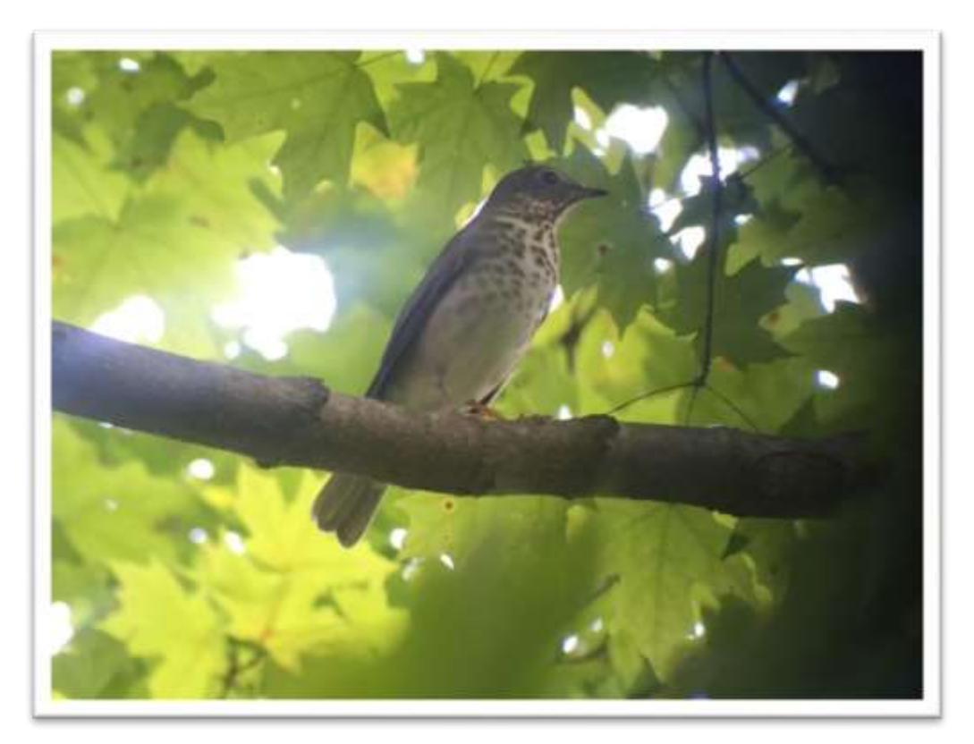
Swainson's Thrush

American Robin - Turdus migratorius Very common in most sites