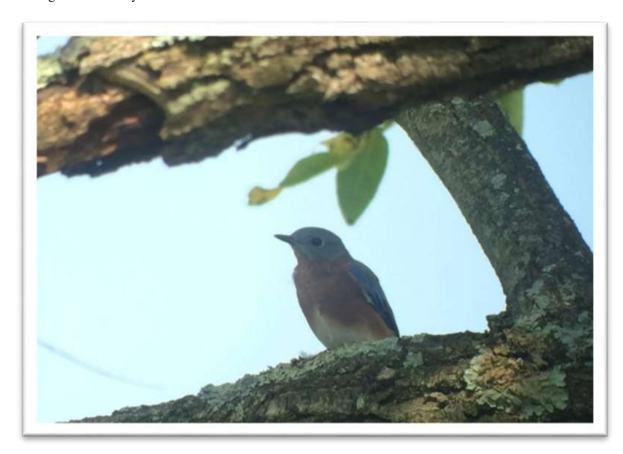
Eastern Bluebird - Photo by Richard Amable

Eastern Bluebird - Sialia sialis One single seen at Parky's Farm