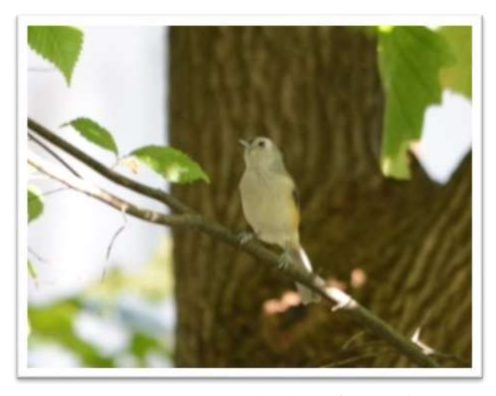
Tufted Titmouse