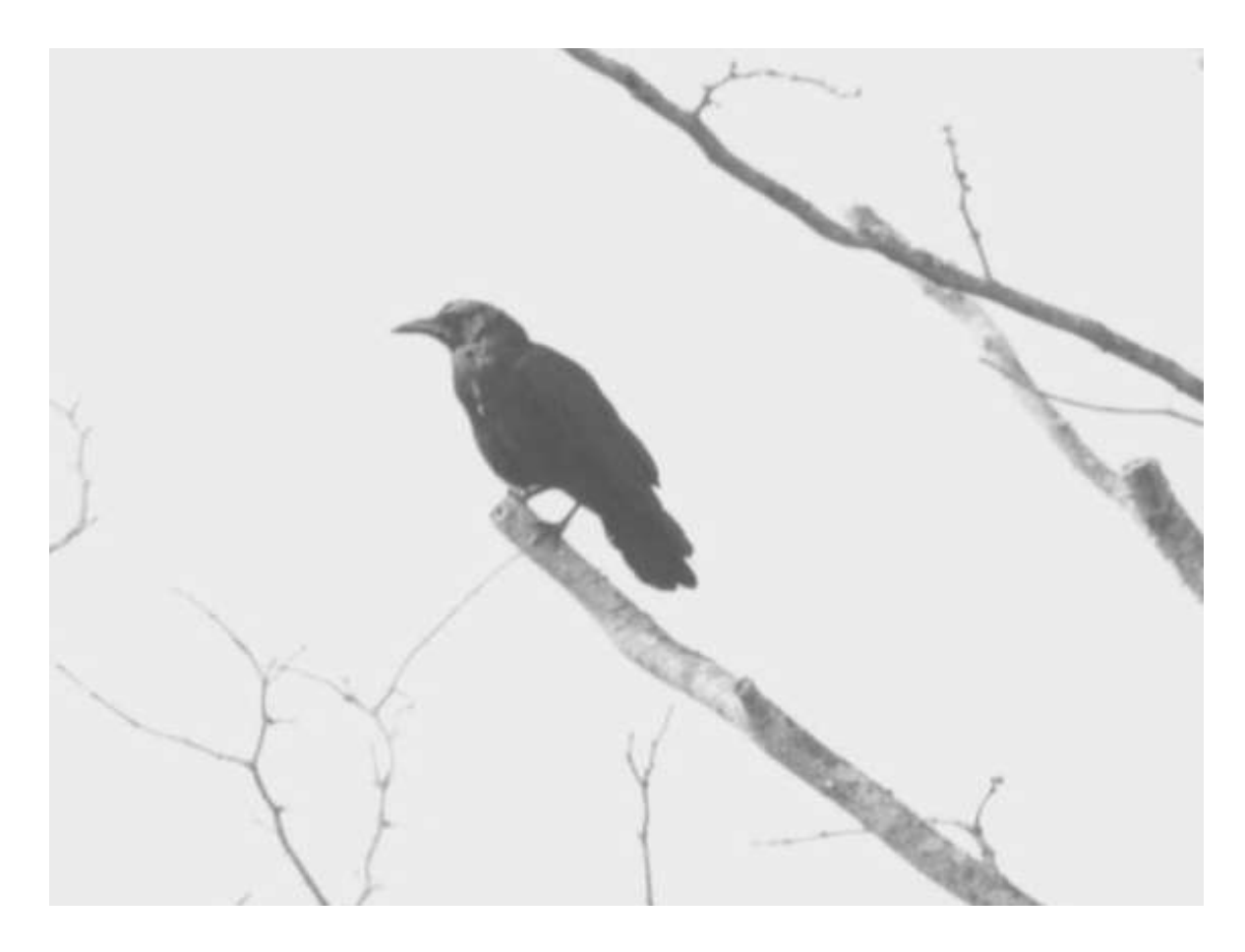
American Crow