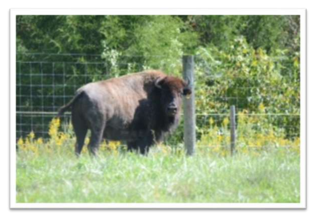
American Bison

White-tailed Deer - Odocoileus virginanus Three seen at Muscatatuck WR