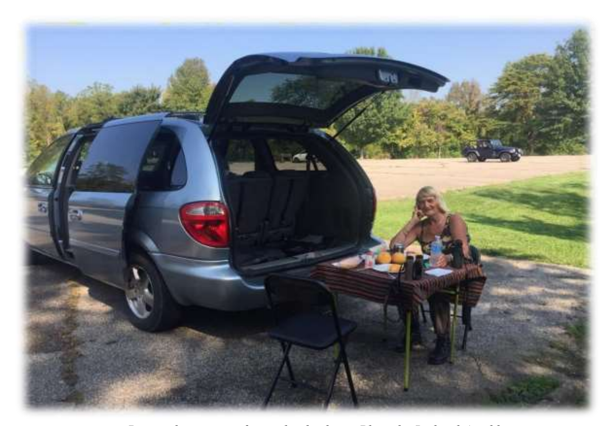
Personalize service for quality birding