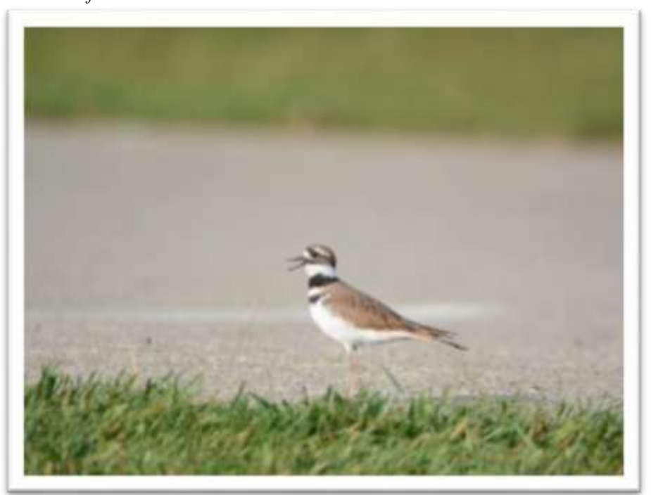
Very common at VOA Park.