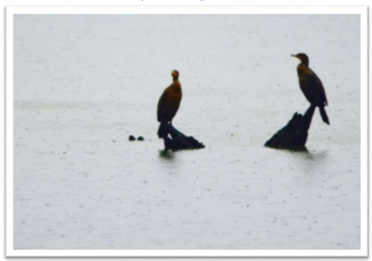
Double-crested Cormorant - Photo by Jennifer Tunningley

Double-crested Cormorant - Phalacrocorax auratus Seen at Muscatatuck WR. Threatened by Climate Change