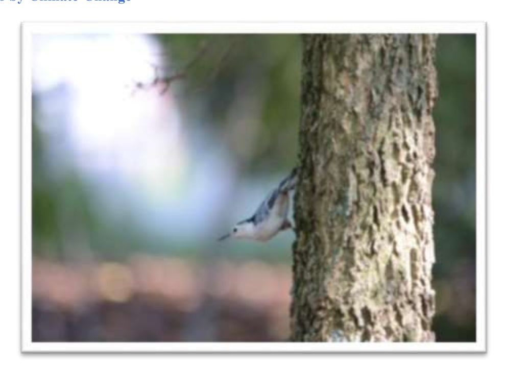
White-breasted Nuthatch

White-breasted Nuthatch - Sitta carolinensis Seen at Mascatatuck WR and couple more at Winton Woods. Common with mixed species flock Threatened by Climate Change