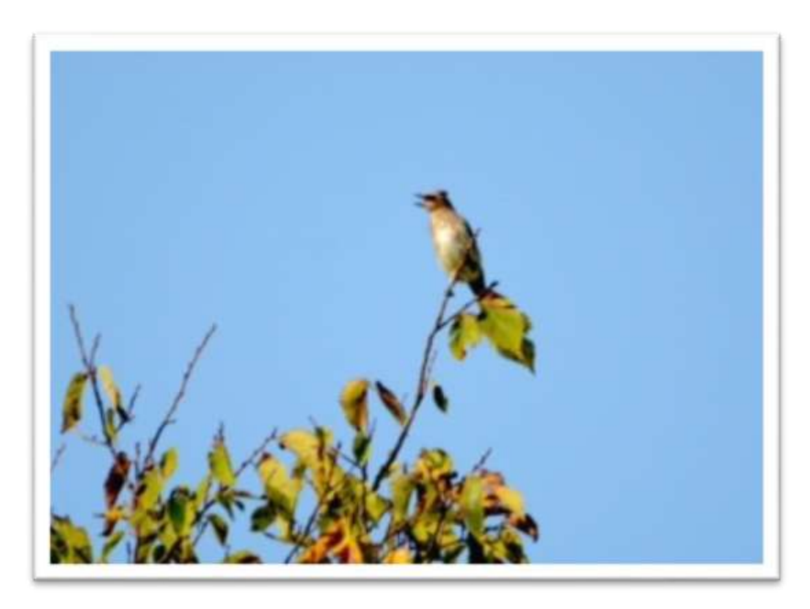
Cedar Waxwing - Photo by Jennifer Tunningley