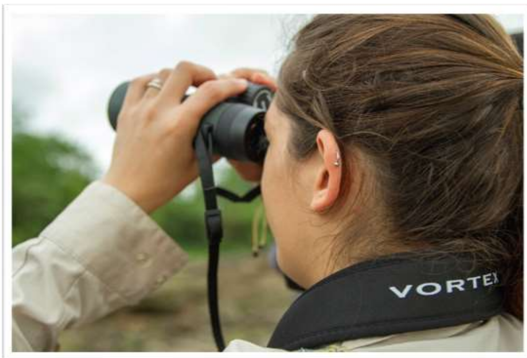
VORTEX OPTICS, the main optics company supporting birding class and education in south eastern