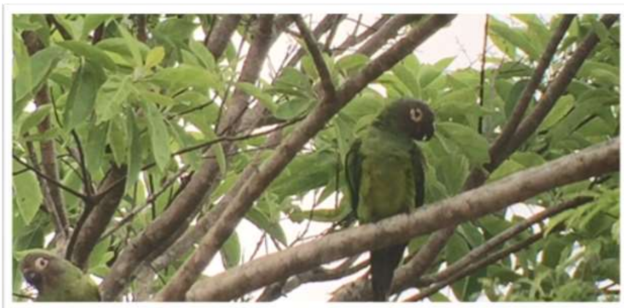
Dusky-headed Parakeet

Several groups flying and passing over the Collpa Cachuela