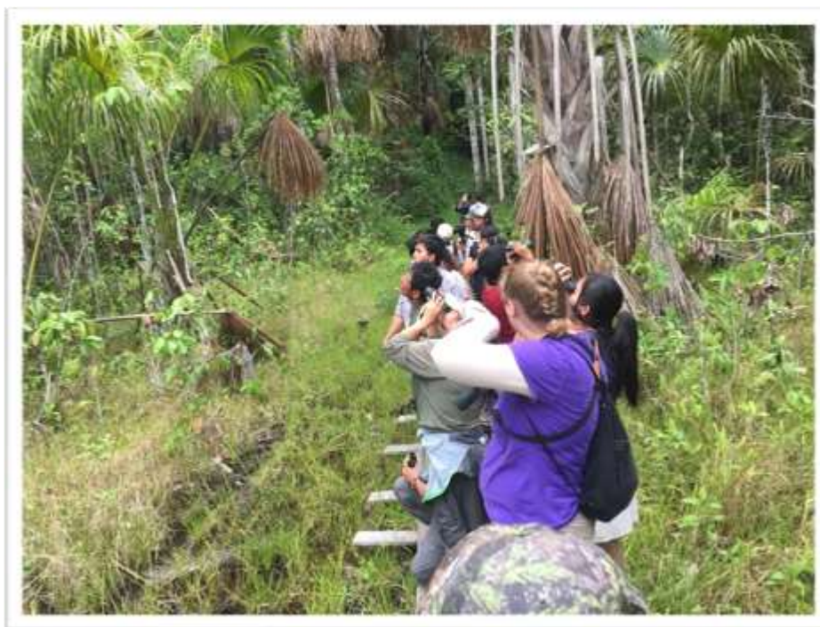
Participants at El Carachamayo learning about Mauritia flexuosa palm, as principal in dominating swamp forest habitat