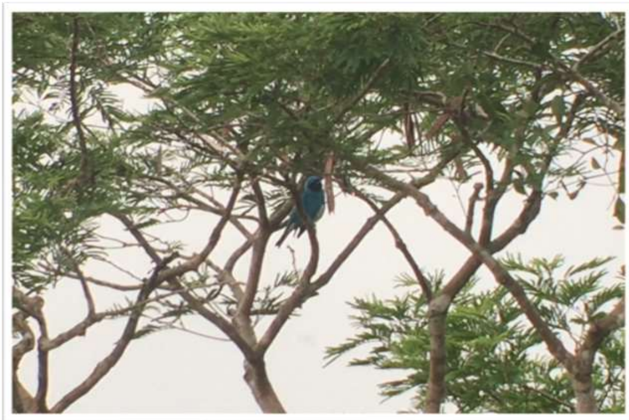
Swallow Tanager