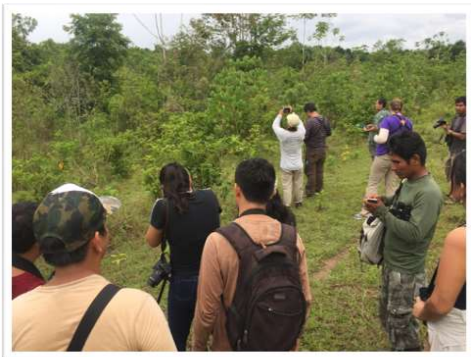
Participants at El Carachamayo learning of grown vegetation of Potrereros habitats