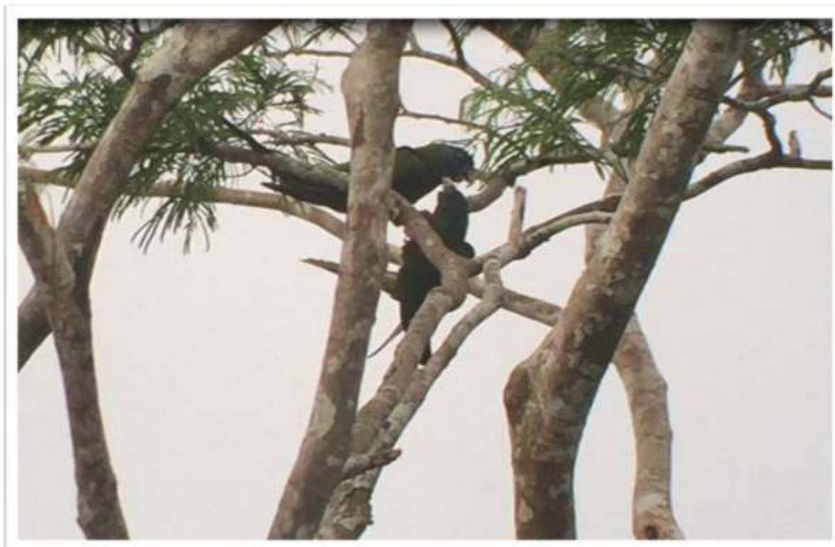
Blue-headed Macaw

About three seen at Collpa Cachuela VULNERABLE