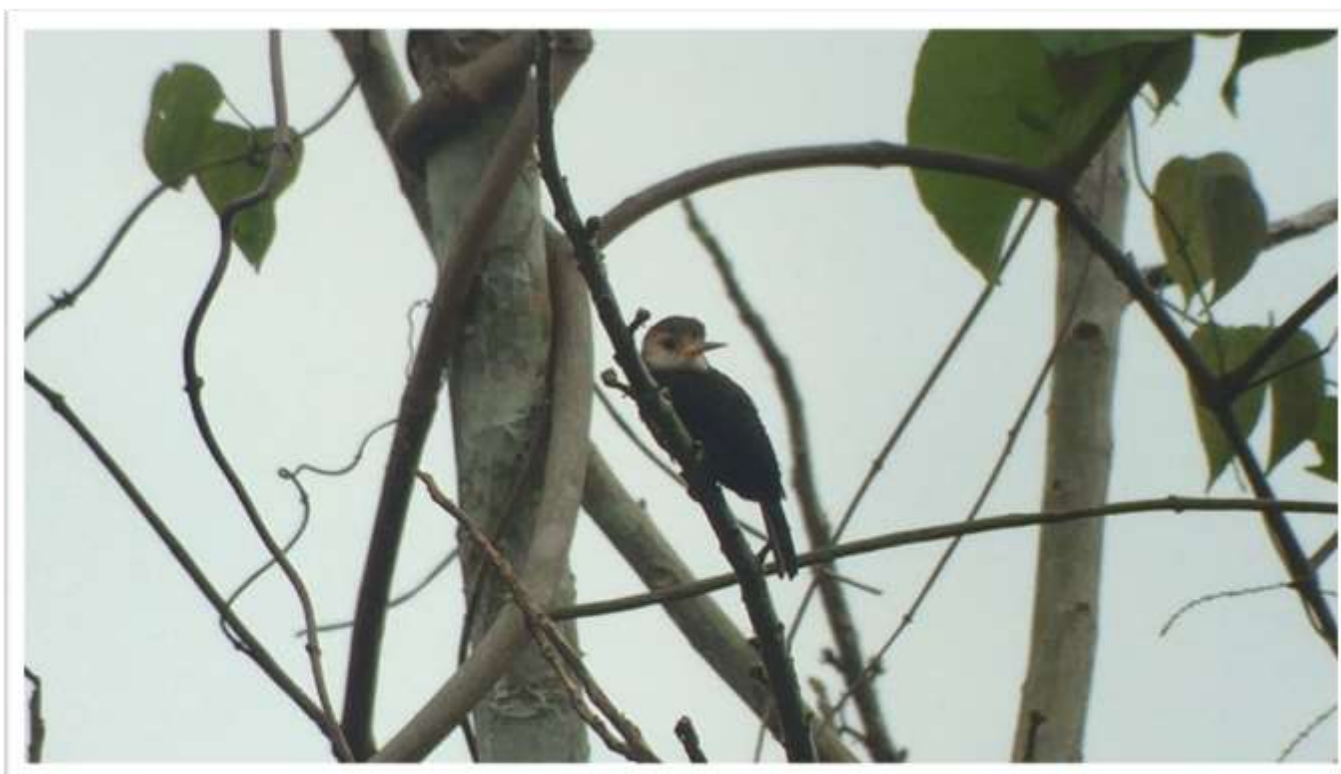
White-throated Jacamar

Two seen at Carachamayo, near trail entrance