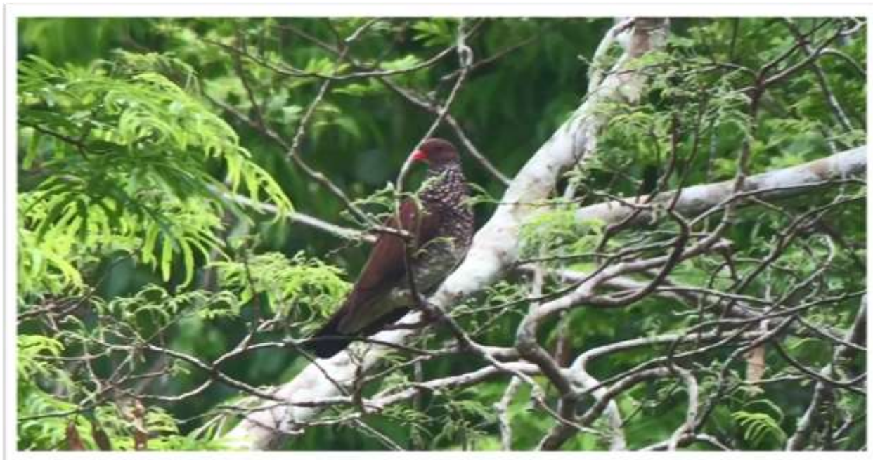
Scaled Pigeon