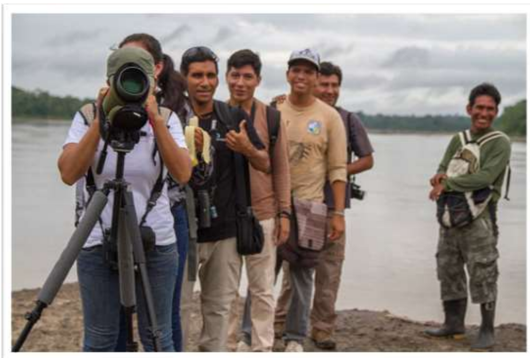
Participants taking eight seconds turns to enjoy view of the sexy Scaled Pigeon at Collpa Cachuela