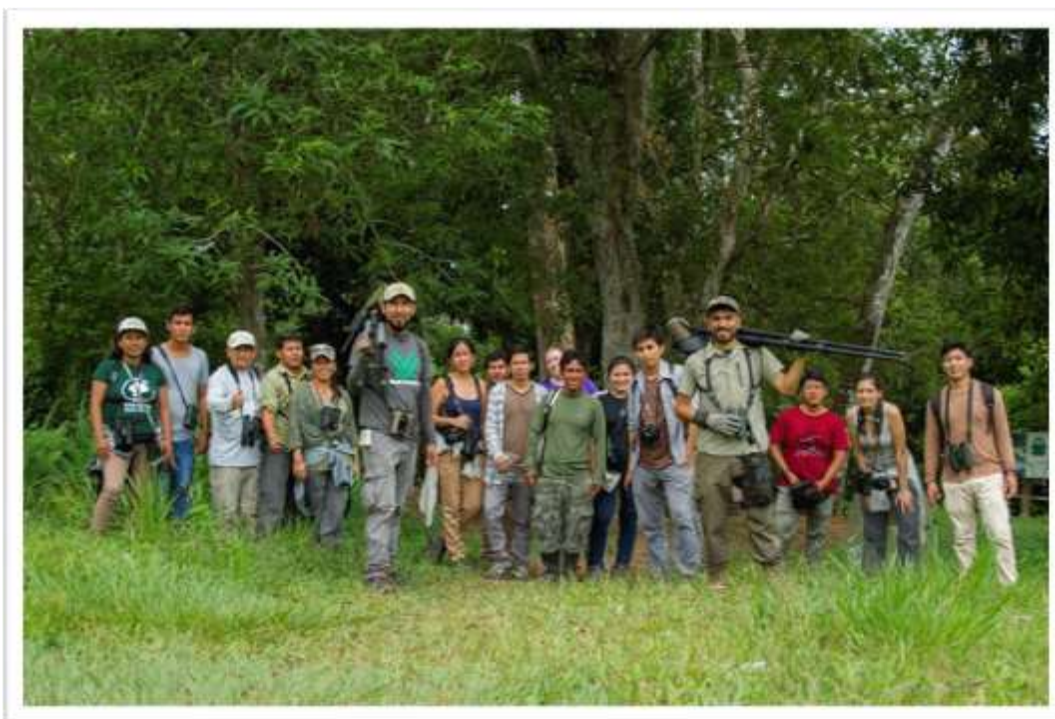
All participants at El Carachamayo in the Prado Community