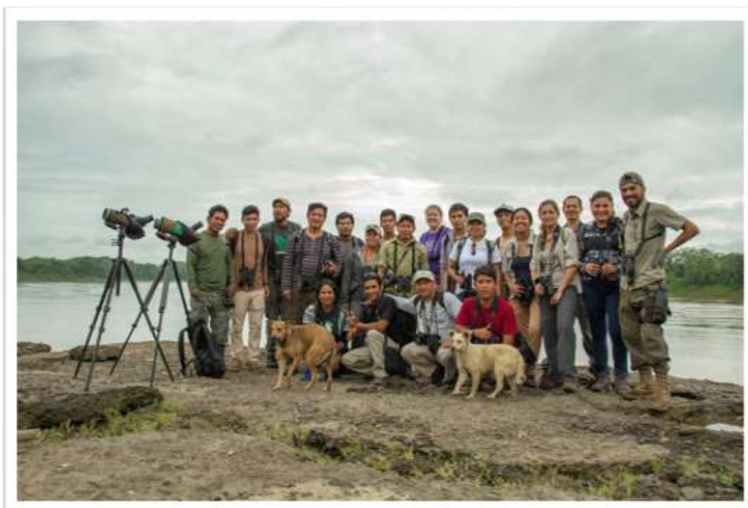
All participants at Collpa Cachuela in the rio Madre de Dios