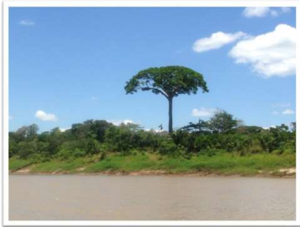
Tambopata River