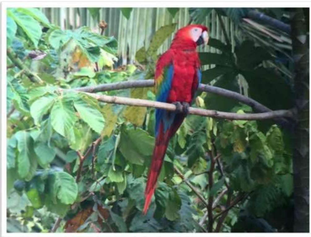
Scarlet Macaw