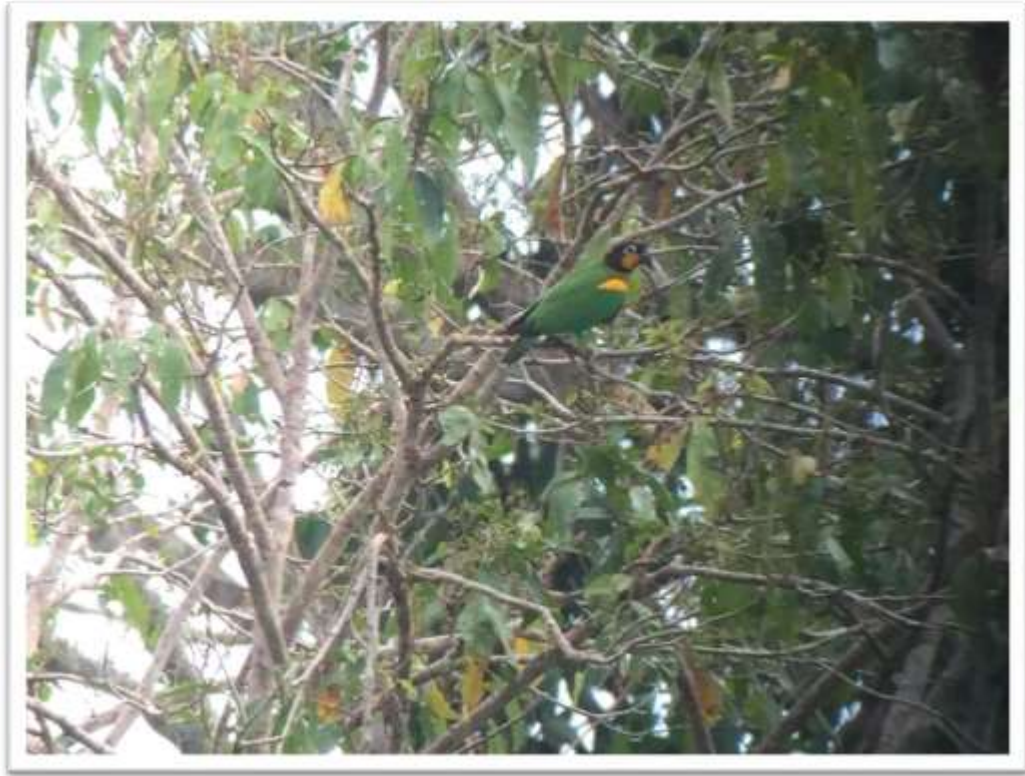
Orange-cheeked Parrot – Richard Amable

Several seen along main trail in Explorer's Inn and few at collpa chuncho