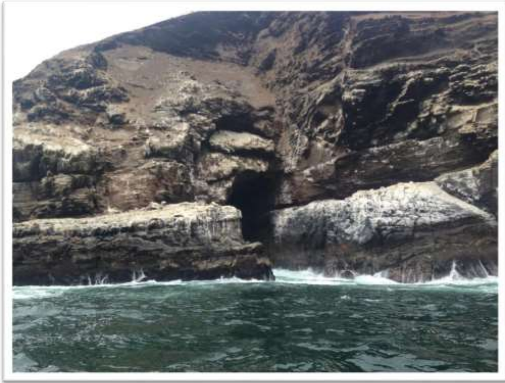
Pucusana