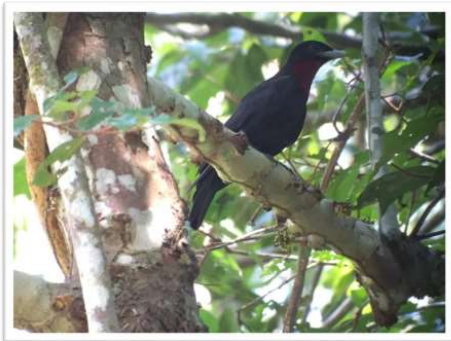
Purple-throated Cotinga

A group of six seen along main trail to the canopy tower in Explorer's Inn