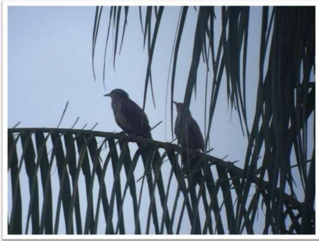
Thrush-like Wren

About eight seen at dusk taking a dust bath at the garden in Explorer's Inn