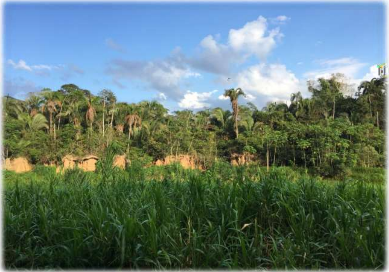
Collpa Chuncho

The tours were managed by custom and design to cover the habitats and record the key species