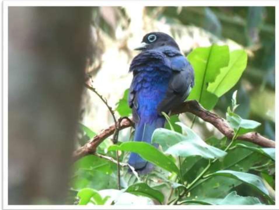
Amazonian Trogon