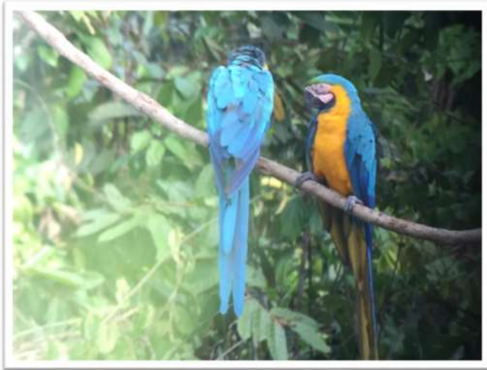
Blue-and-yellow Macaw