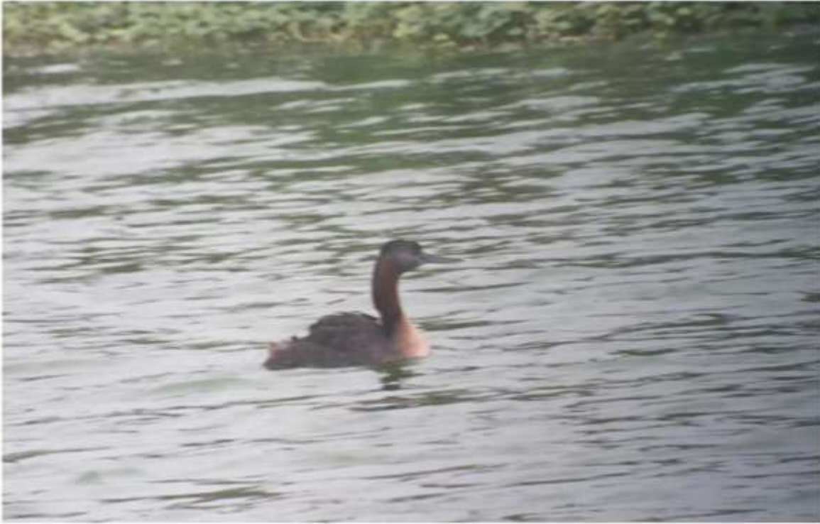
Great Grebe