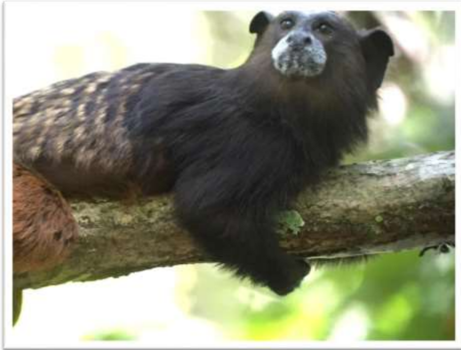
Weddell's Saddle-backed Tamarin – Richard Amable

About eight seen in different sites, together with Black-capped Squirrel Monkey at Explorer's Inn