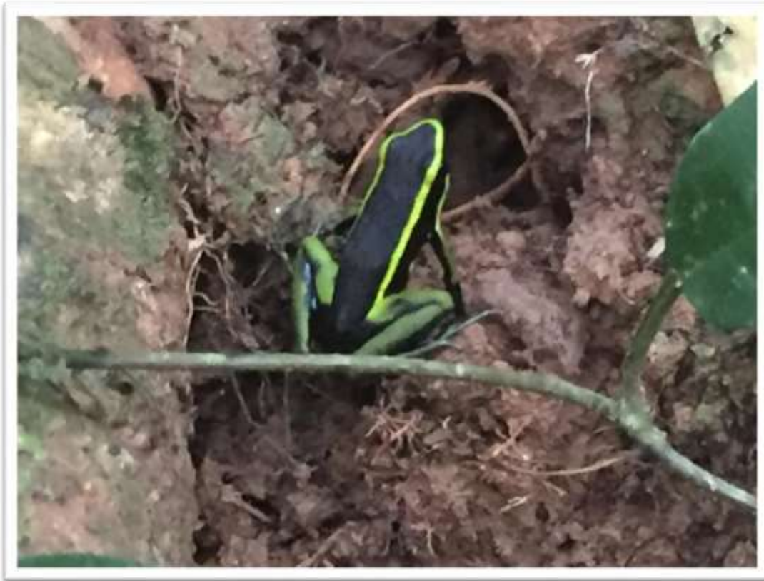
Three-striped Poison Dart Frog