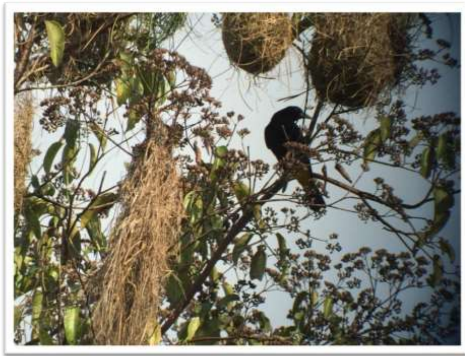
Yellow-rumped Cacique

Common in most sites in the Tambopata area