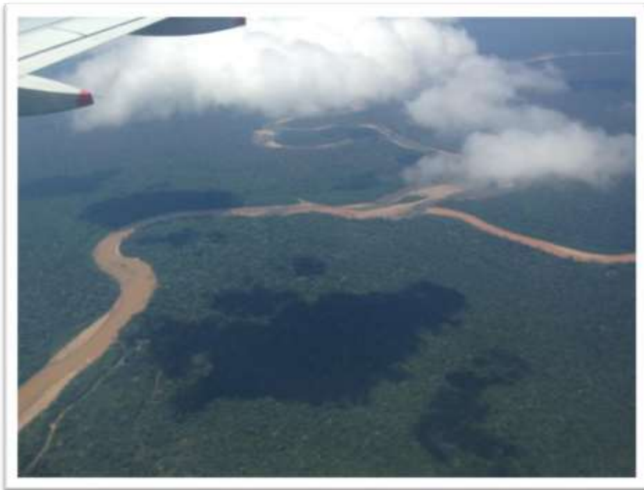
Tambopata River