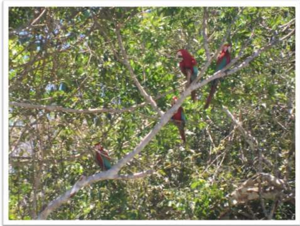
Red-and-green Macaw

Common on daily visit at collpa chuncho in the Tambopata river