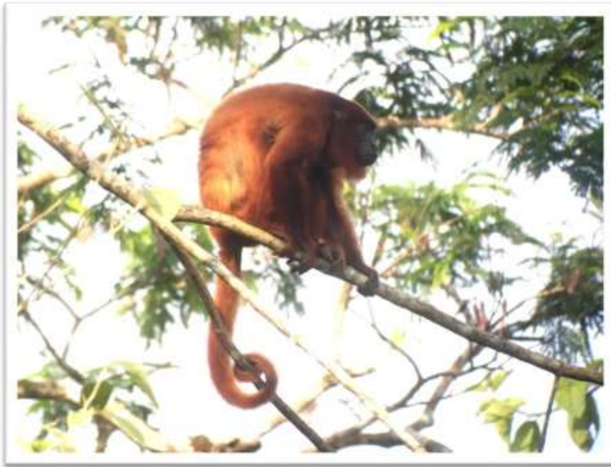
Colombian Red Howler Monkey

Common, two family group seen at the garden in Explorer's Inn