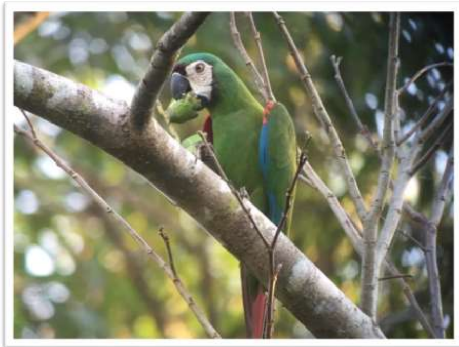
Chestnut-fronted Macaw

Common at Explorer's Inn garden and Rio Tambopata, also at collpa Chumcho and collpa Cachuela