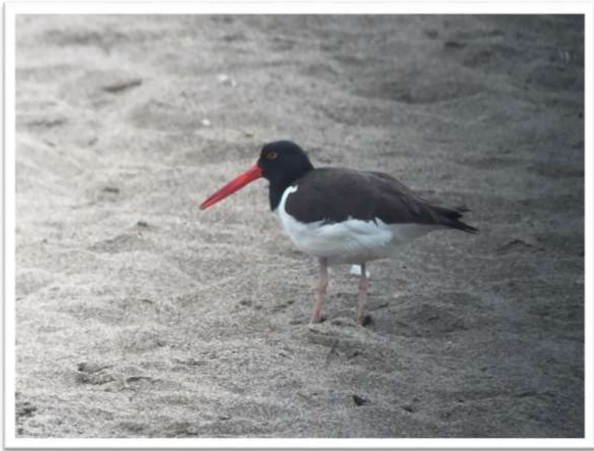
American Oystercatcher

About ten seen at sand bank, next to the sea in Villa Marshes