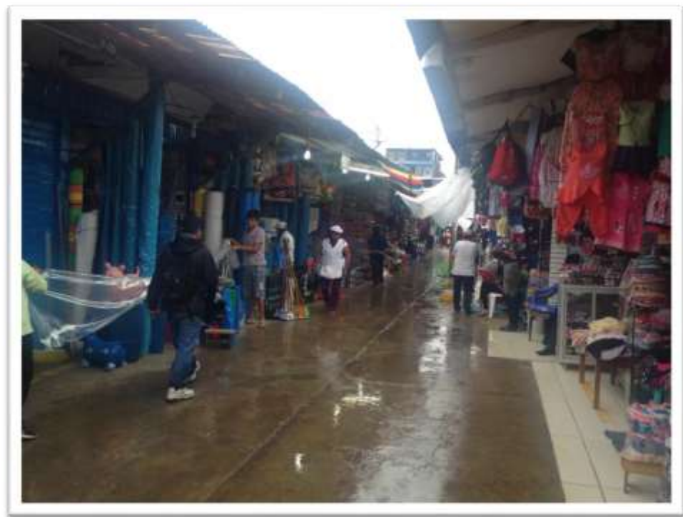
Puerto Maldonado local market