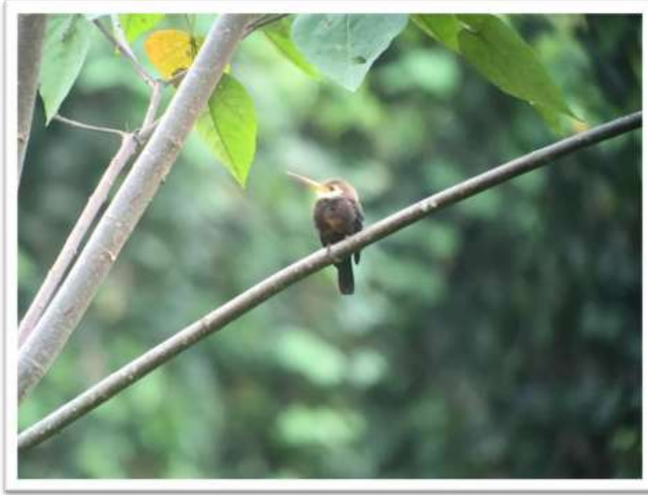
White-throated Jacamar

Two seen at Pastora road near Puerto Maldonado