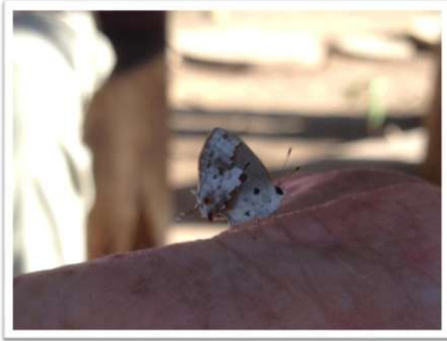
Megarus Scrub Hairstreak