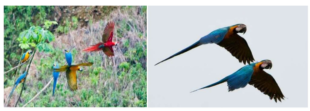
Scarlet and Blue-and-yellow Macaws; Blue-and-yellow Macaws (both at Collpa Colorado, TRC)