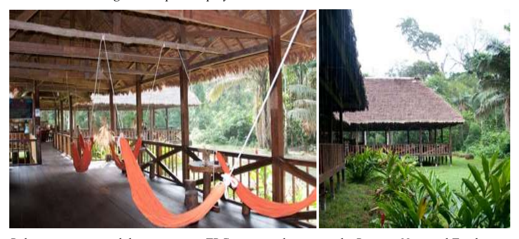
Relaxation space and dining room at TRC, set in a clearing in the Reserva Nacional Tambopata