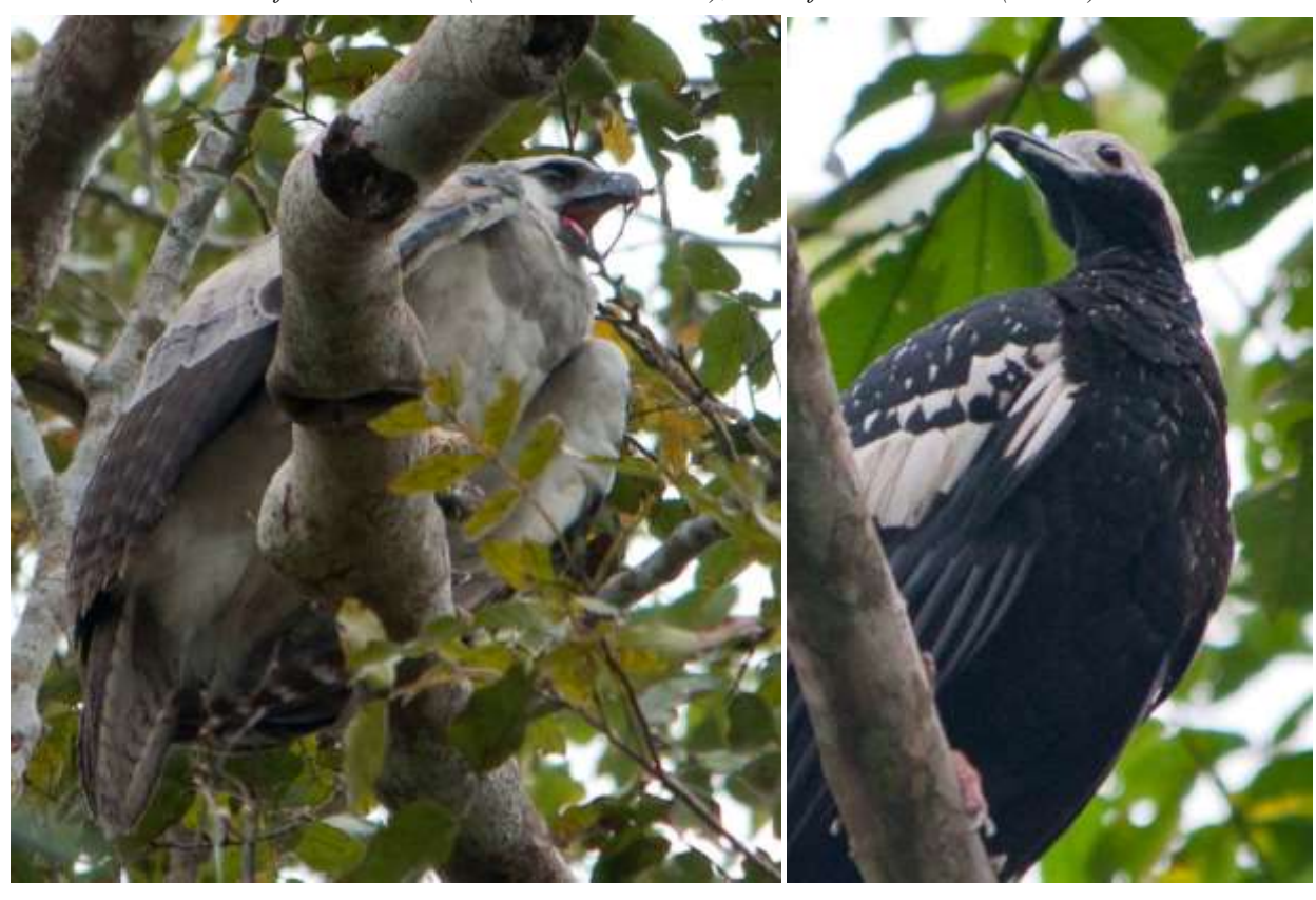
Immature Harpy Eagle (at Refugio Amazonas); Blue-throated Piping-Guan (at TRC)