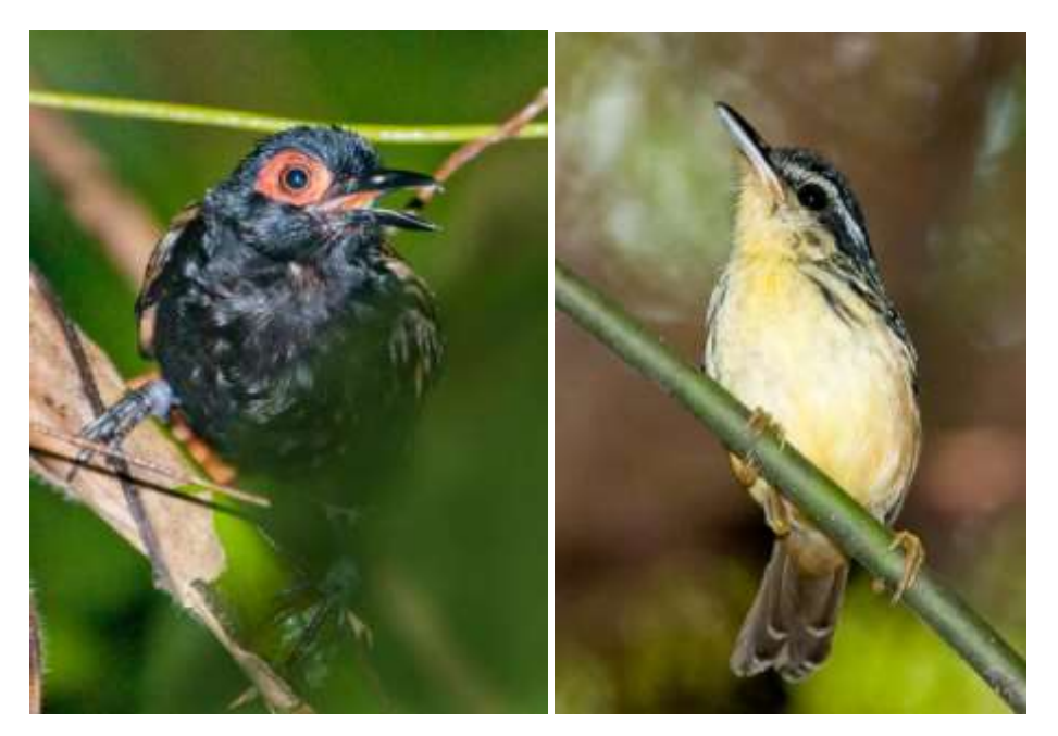
Black-spotted Bare-Eye (at TRC); Yellow-bellied Warbling-Antbird (at Puesto de Control Malinowsky)