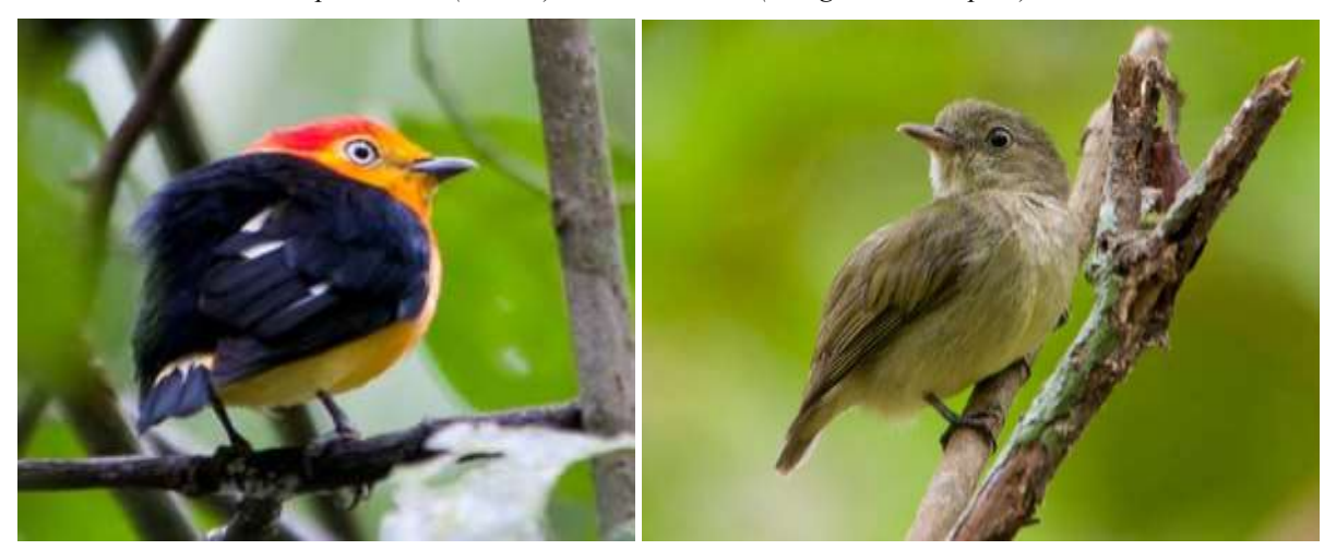
Band-tailed Manakin; Pygmy Tyrant-Manakin (both at TRC)