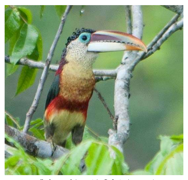
Curl-crested Araçari (at Refugio Amazonas)

The overall quality of the wilderness experience was excellent, with the superb setting enhanced by the professional guiding. The lodging was also just right. The simplicity (no hot water [except at Posada Amazonas], minimal electricity, shared facilities [at TRC only] and just a mosquito net but no windows separating the beds from the forest) was consistent with the remote locations, however the lodges were immaculately clean, offered excellent food, demonstrated environmentally sensitive practices and the staff were welcoming and helpful. TRC, being the smallest of the lodges, had a particularly remote and special atmosphere complete with an interesting mix of fellow visitors, guides and macaw researchers with whom to share dinner and a cold Cusqueña or Pisco Sour!