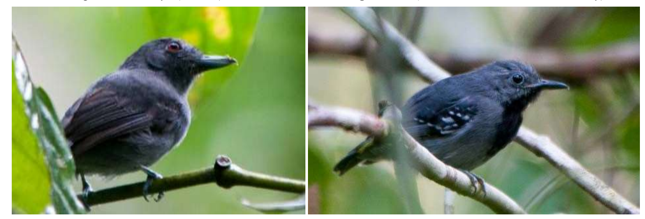
Plain-winged Antshrike (at TRC); Long-winged Antwren (at Refugio Amazonas)