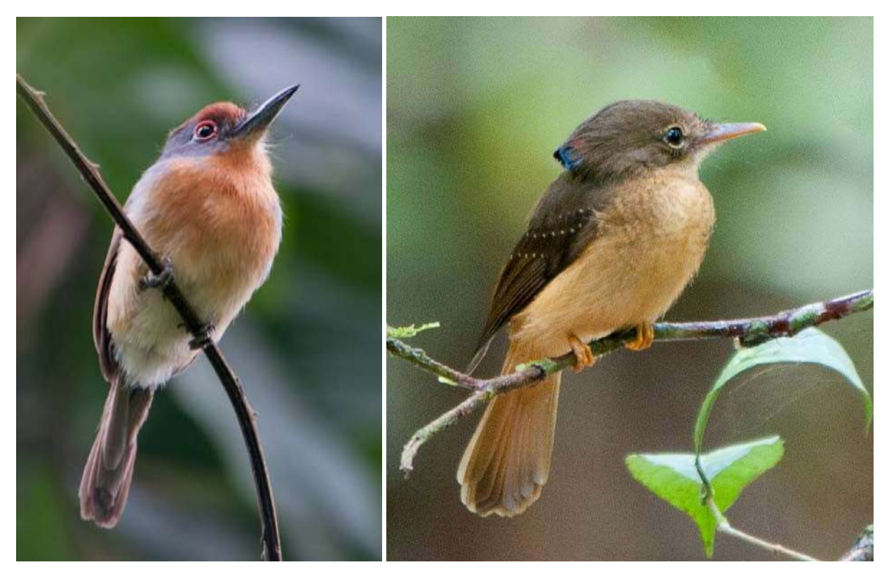
Rufous-capped Nunlet (at TRC); Royal Flycatcher (at Refugio Amazonas)