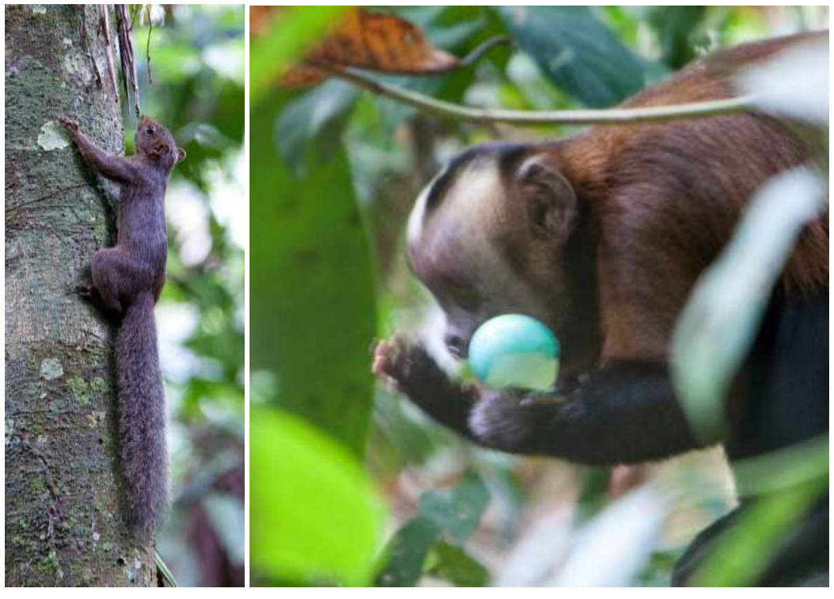
Bolivian Squirrel; Brown Capuchin monkey eating a presumed Tinamou egg (both at TRC)