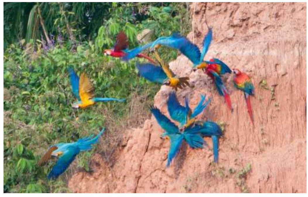
Blue-and-yellow Macaws and Scarlet Macaws (at Collpa Colorado, TRC)

Narrow-snouted Spectacled (White) Caiman Caiman crocodylus [TRC; RioT]: Several seen in various ponds, whilst a very large individual was seen showing off his teeth as he basked on a sand-bank upstream of Puesto de Control Malinowski.