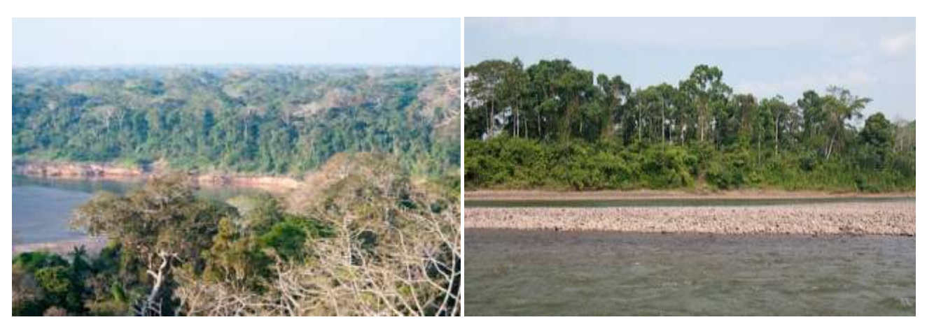
View of Río Tambopata from Posada Amazonas' Canopy Tower; Views along Río Tambopata near to TRC