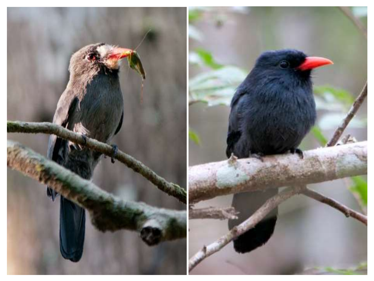
White-fronted Nunbird (at Posada Amazonas); Black-fronted Nunbird (at TRC)