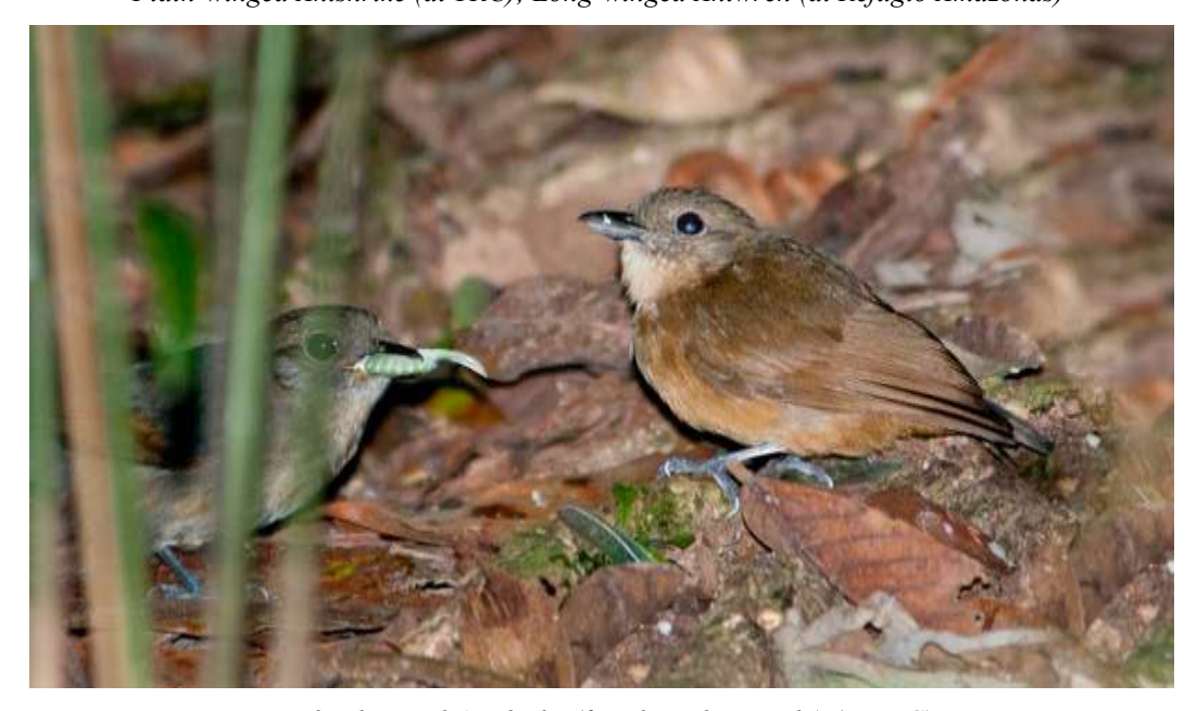
Dusky-throated Antshrike (female with juvenile) (at TRC)