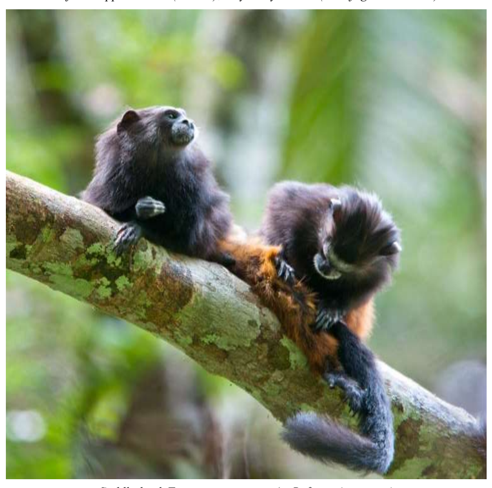
Saddle-back Tamarins grooming (at Refugio Amazonas)