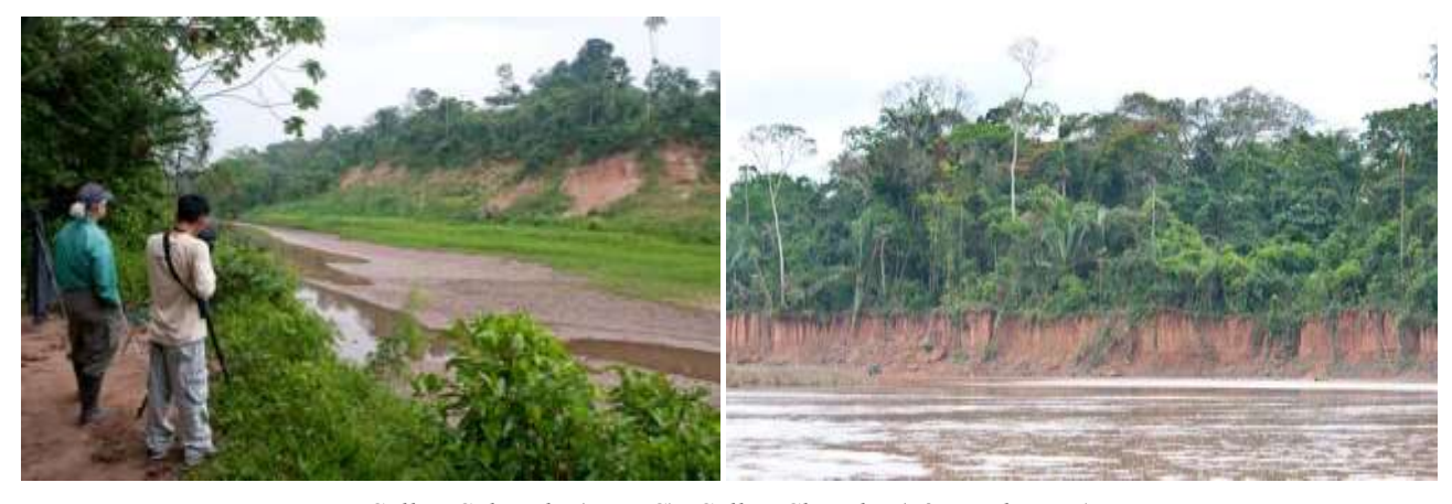
Collpa Colorado (at TRC); Collpa Chuncho (Río Tambopata)