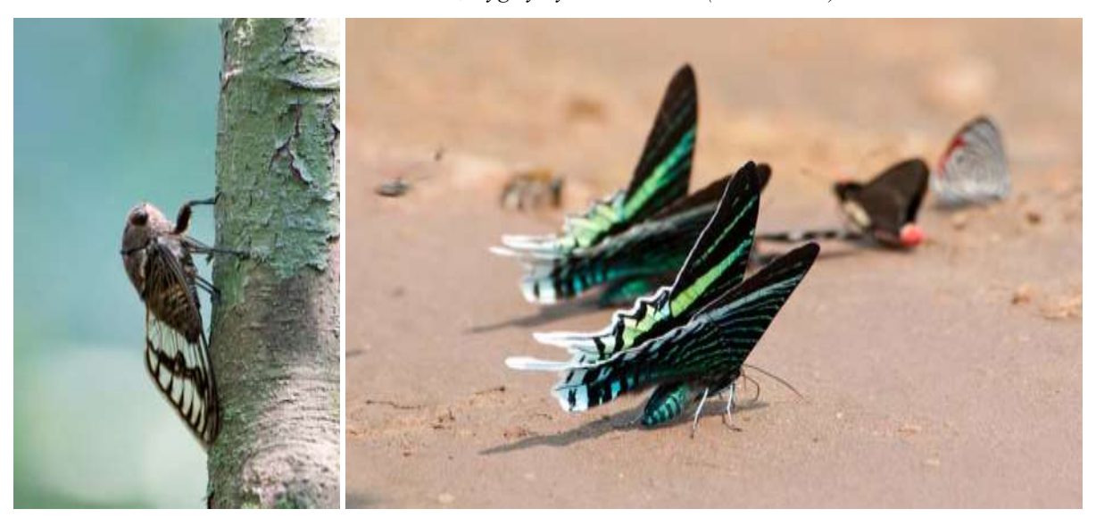
Cicada (at Posada Amazonas); Butterflies (along Río Tambopata)