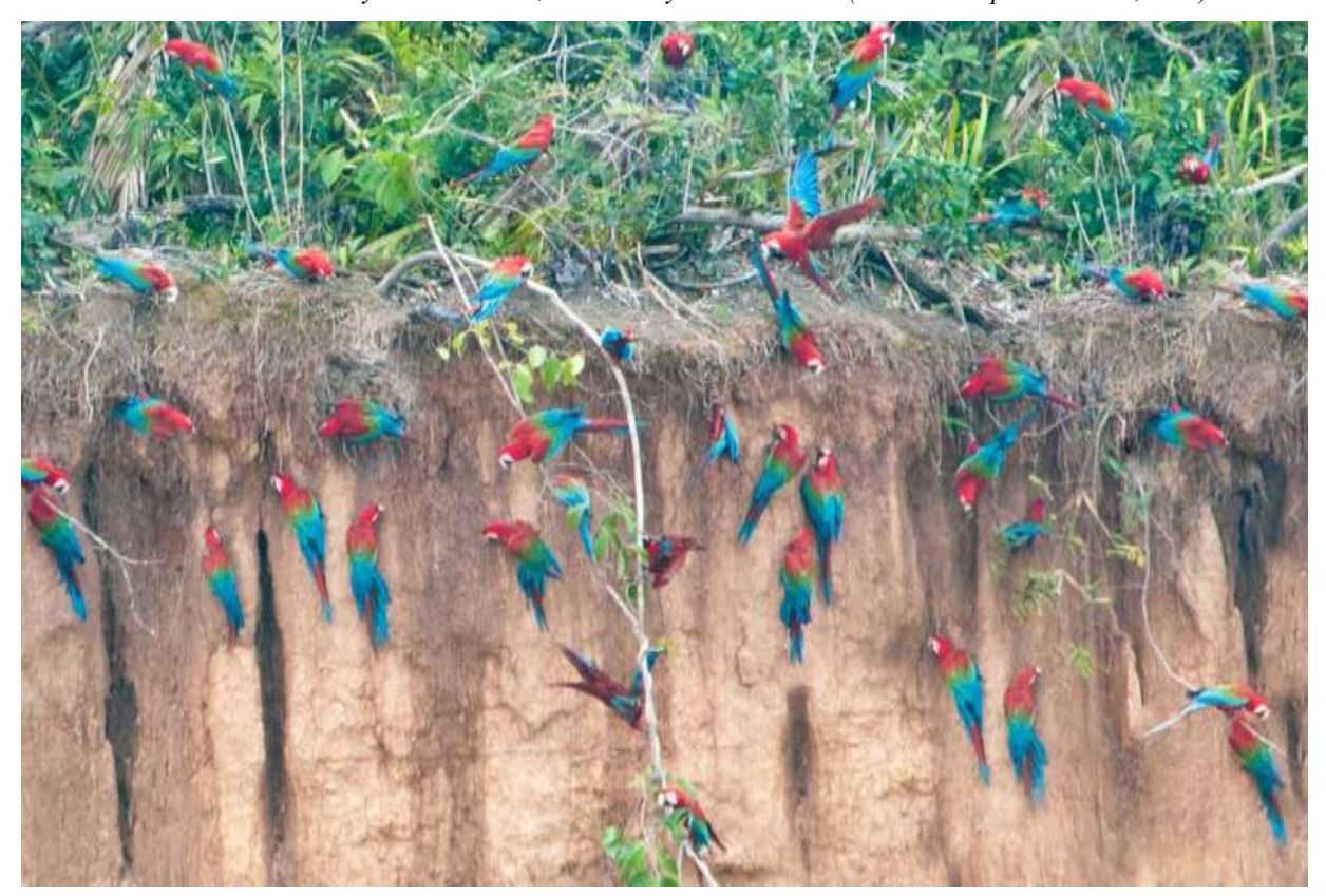
Red-and-green Macaws (at Collpa Chuncho, Río Tambopata)