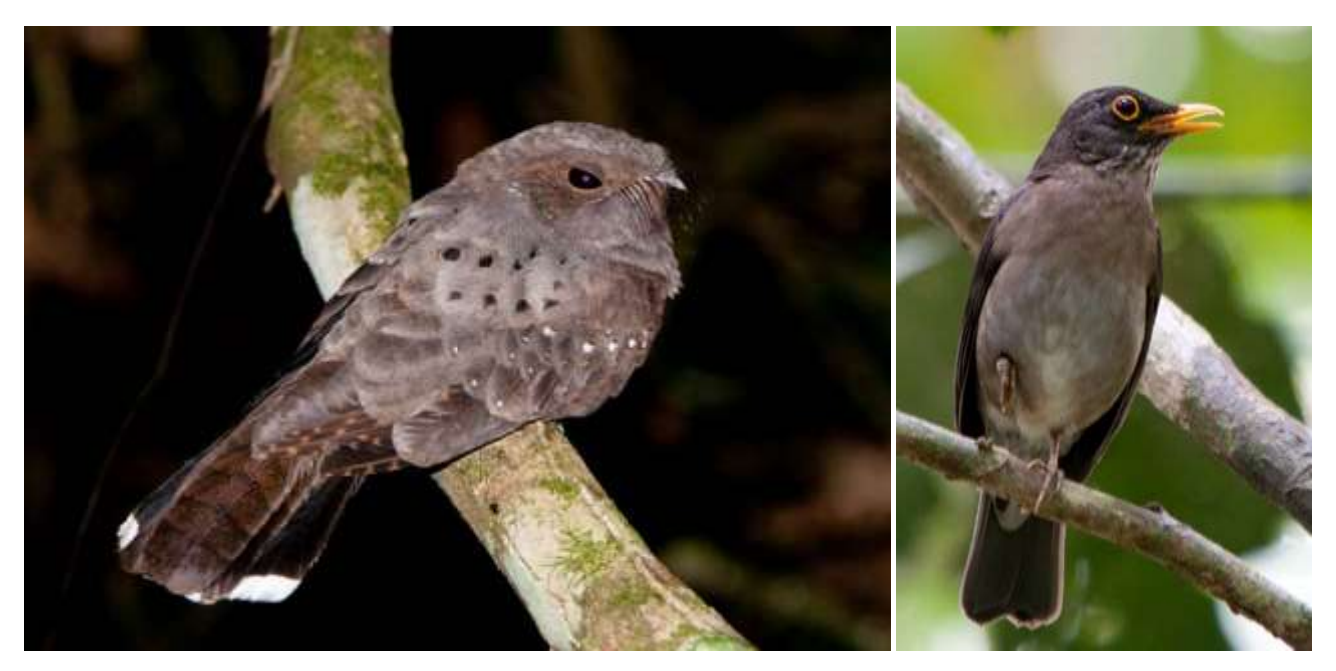
Ocellated Poorwill; Lawrence's Thrush (both at TRC)