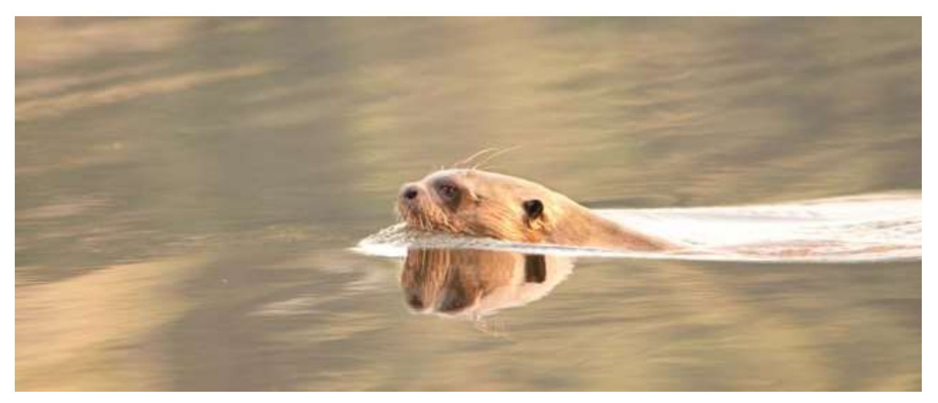
Giant Otter (at Tres Chimbadas)