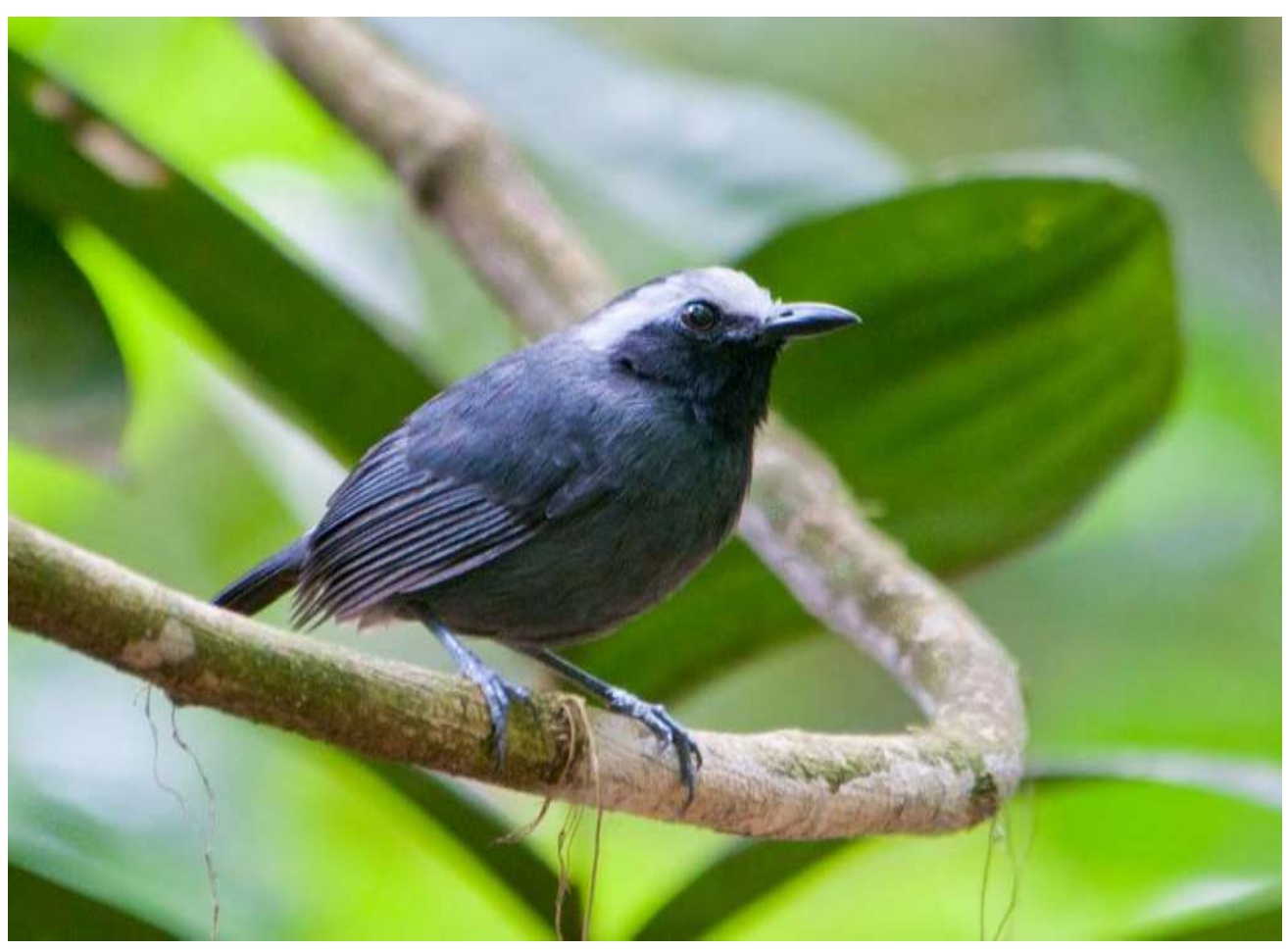
White-browed Antbird (at TRC)