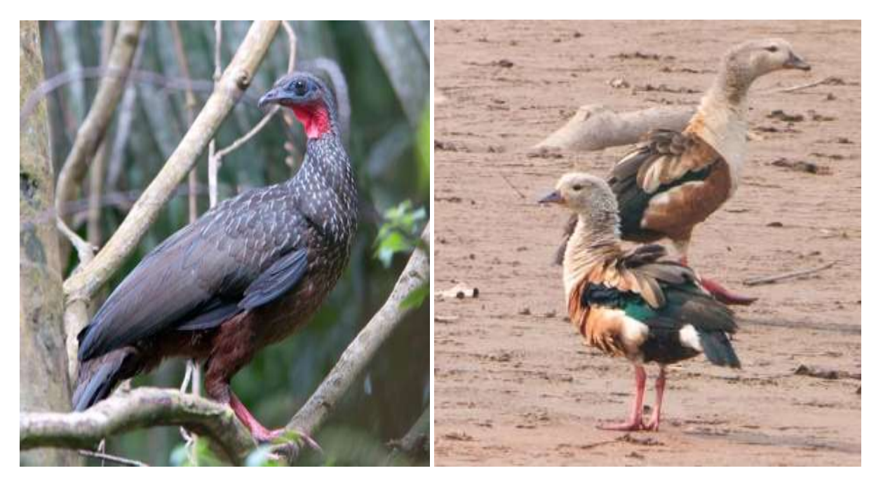
Spix's Guan (at TRC); Orinoco Goose (along Río Tambopata)