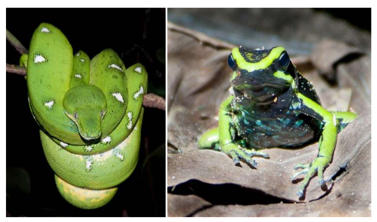
{\it Emerald Tree Boa (at Refugio Amazonas); Poison Dart Frog (at TRC)}