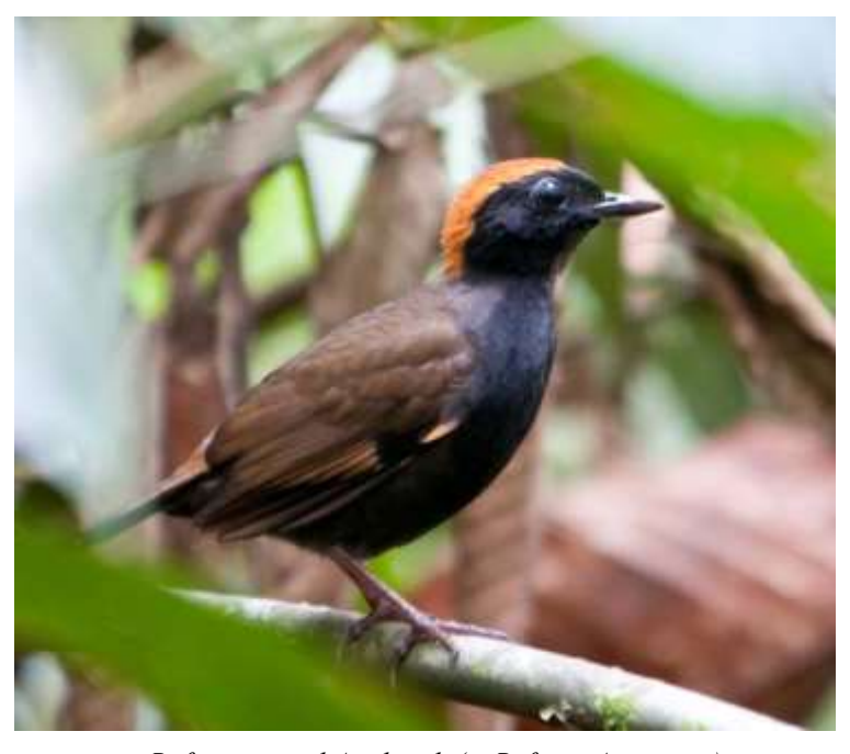
Rufous-capped Antthrush (at Refugio Amazonas)